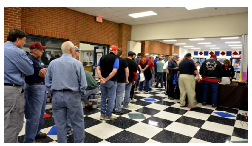
Are you sure they don't deliver?