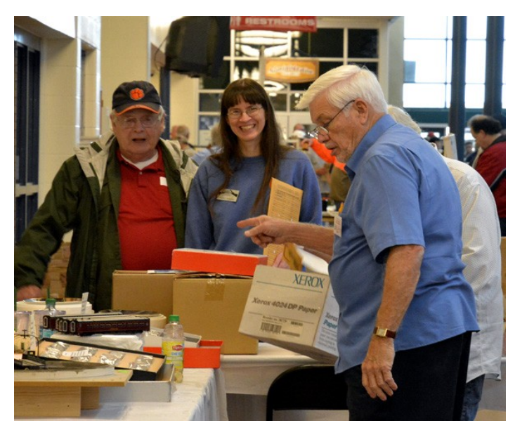
I know I've got another one of those somewhere.