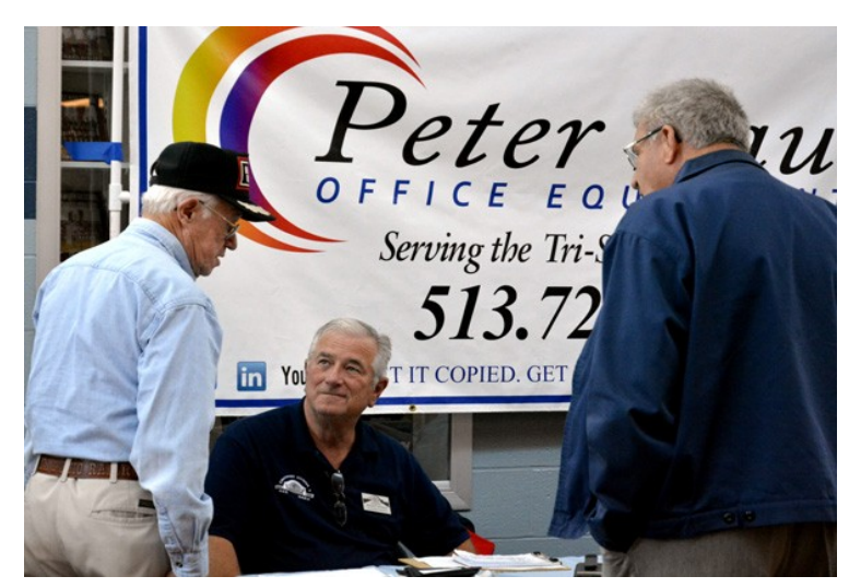
We never had crowds this big.