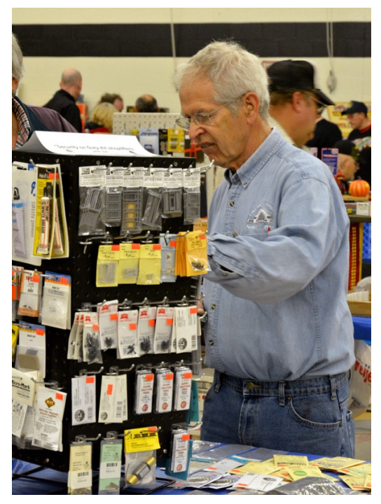
I better get a spare