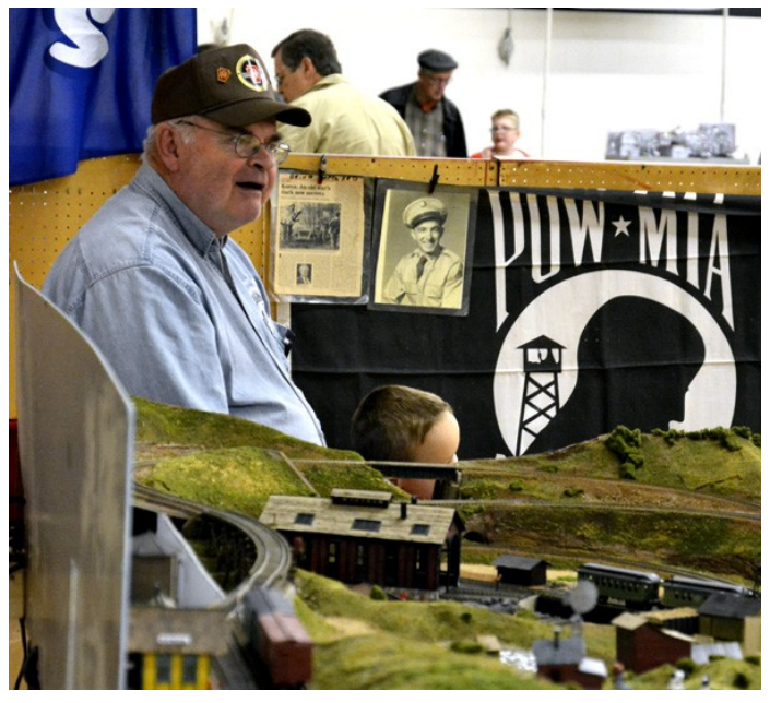
Great way to baby sit