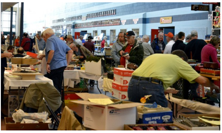
Business is Booming