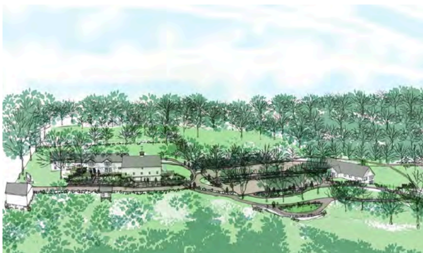
Maple Hill Farm