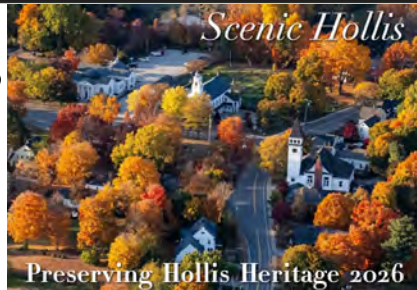
Calendar Cover

During Old Home Days, be sure to walk into the Noah Dow Cooper Shop located at Nichols Field. Visitors are welcome to tour the building during Old Home Days as well as on select weekends in the fall. Look for the "Open" flag to explore the history of coopering, a barrel-making winter industry that once supported local farms.