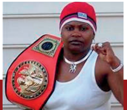
Carlette Ewell, Female World Boxing Heavyweight Champion