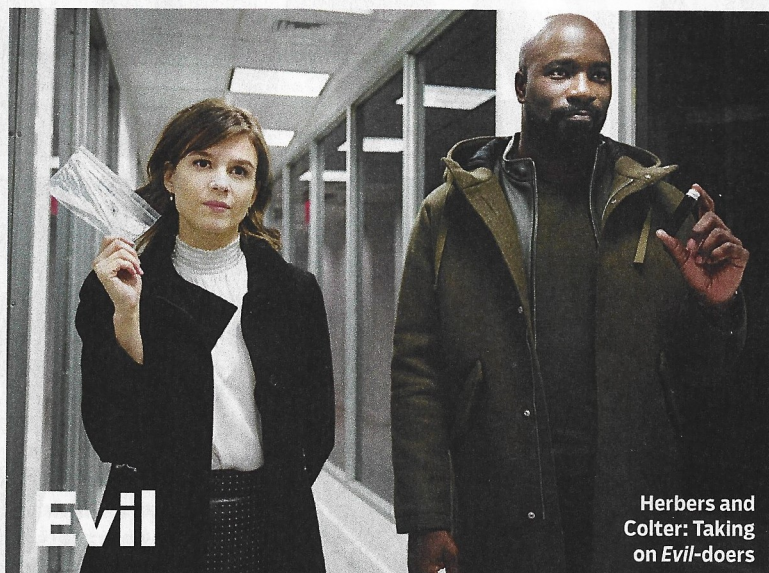
Herbers and Colter: Taking on Evil -doers