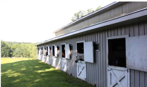
13+ school horses & ponies to choose from