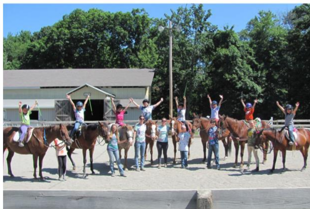
Always such an amazing week