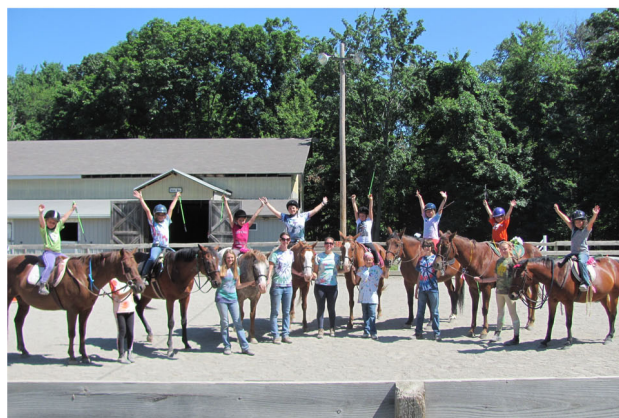
Always such an amazing week