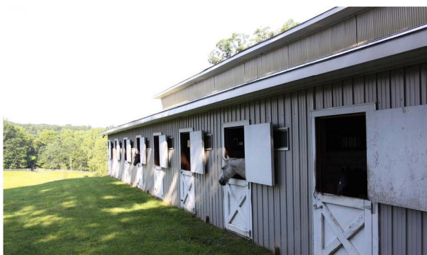
20+ school horses & ponies to choose from