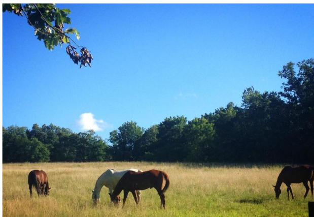
120 acres of rolling pastures