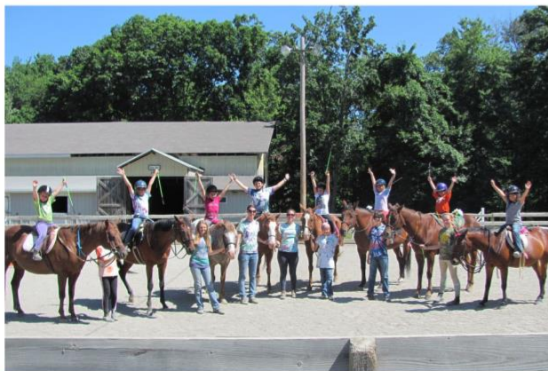
Always such an amazing week