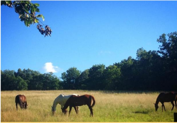
120 acres of rolling pastures