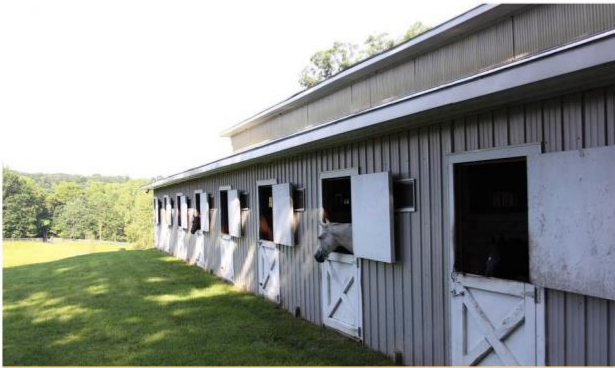
13+ school horses & ponies to choose from