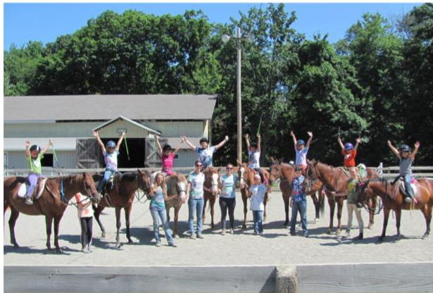
Always such an amazing week