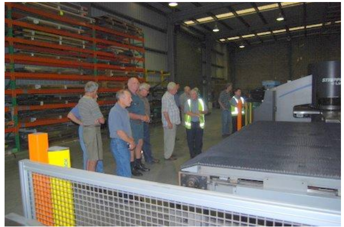
Shed members watch the laser cutting demonstration.

Laser metal cutting was the subject of a visit to the Wacol industrial area.