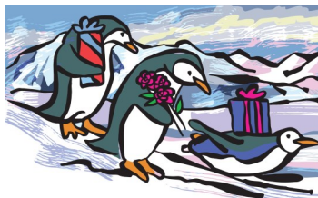
JANUARY BIRTHDAYS & ANNIVERSARIES