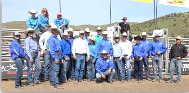
The Eagle Rodeo Team