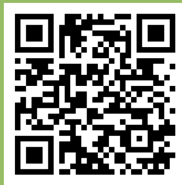
Sober Livers' Postcard