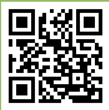
Sober Livers' Website