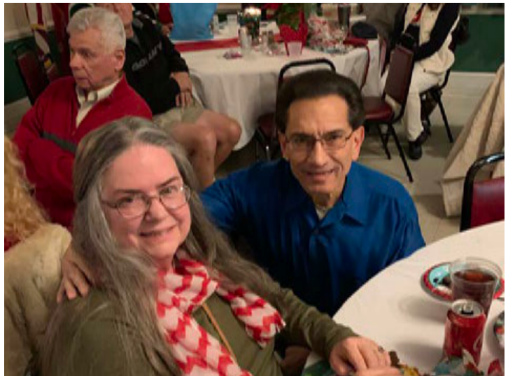
Assorted photos from members and guests attending the different events at the Post, e.g. the Crab Feast, Bull and Oyster Roast and Christmas Party and other Post patriotic celebrations during 2019.