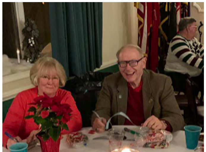
Assorted photos from members and guests attending the different events at the Post, e.g. the Crab Feast, Bull and Oyster Roast and Christmas Party and other Post patriotic celebrations during 2019.