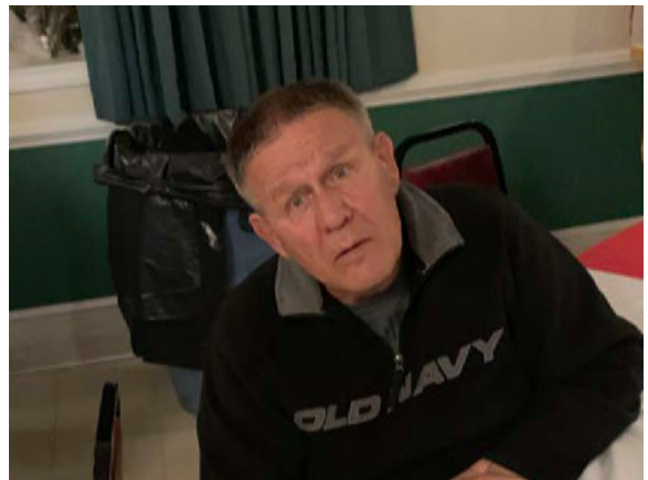
Assorted photos from members and guests attending the different events at the Post, e.g. the Crab Feast, Bull and Oyster Roast and Christmas Party and other Post patriotic celebrations during 2019.