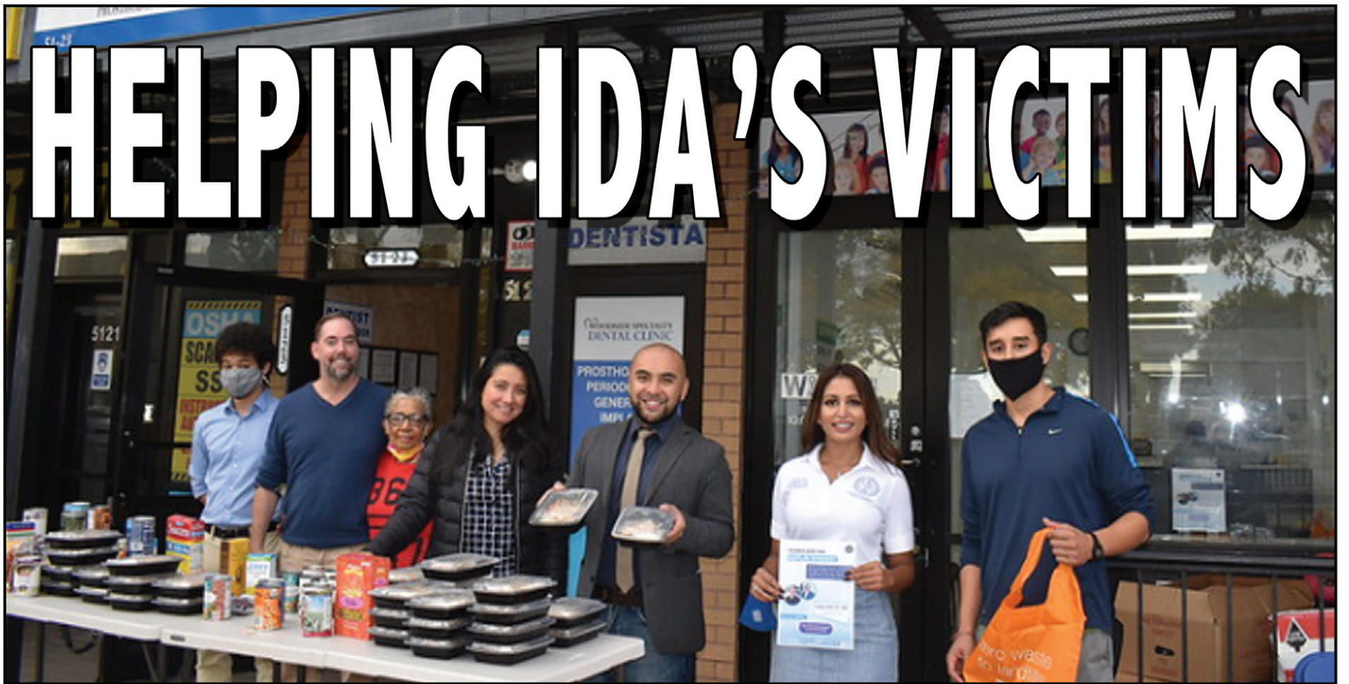
CLEANING SUPPLIES DISTRIBUTION EVENT FOR HURRICANE IDA VICTIMS, SUPPORTING DOZENS OF LOCAL RESIDENTS