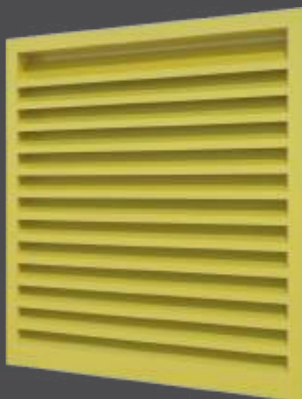
75MM PITCH 'Z'