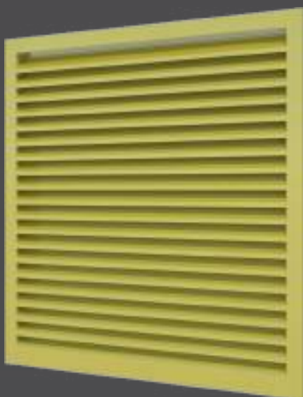
50MM PITCH 'Z'