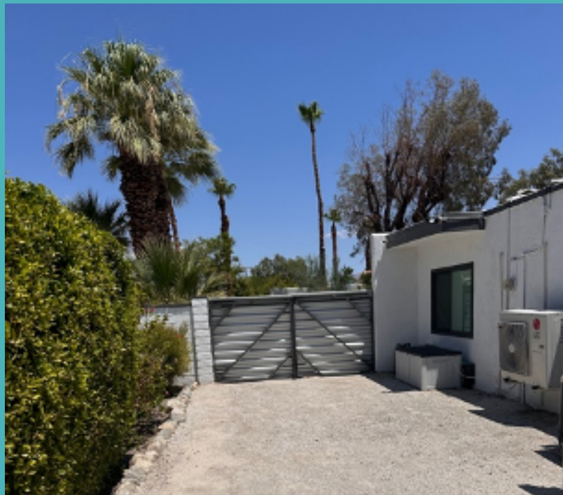
Location of Gas Meter

Move the yellow valve to a down position to allow gas to flow to the fire pit.