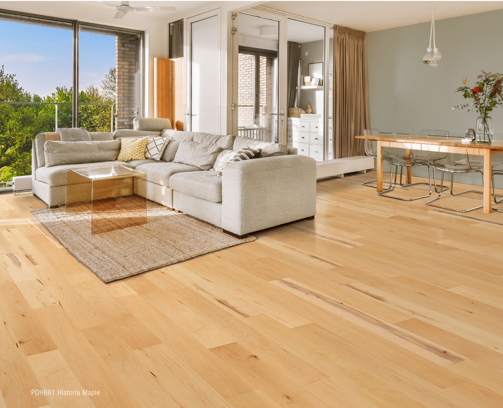
PDH661 Historia Maple