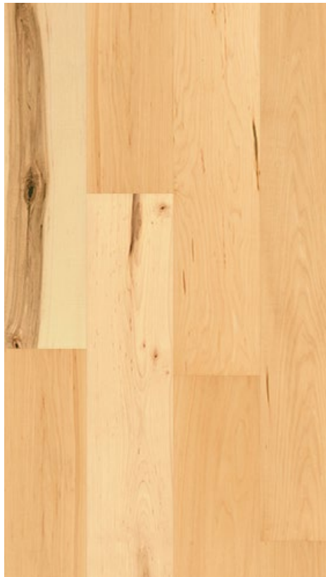
PDH661 Historia Maple