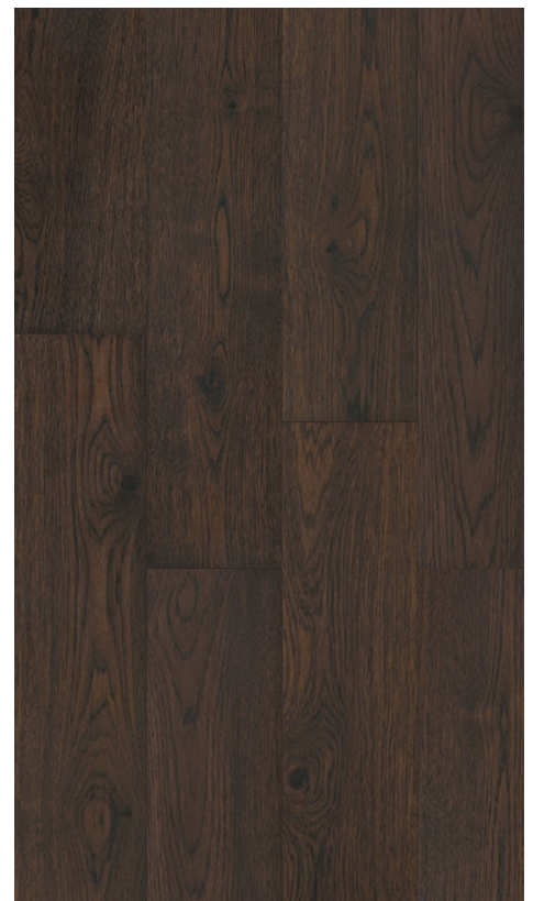
PDH660 Black Forest Hickory