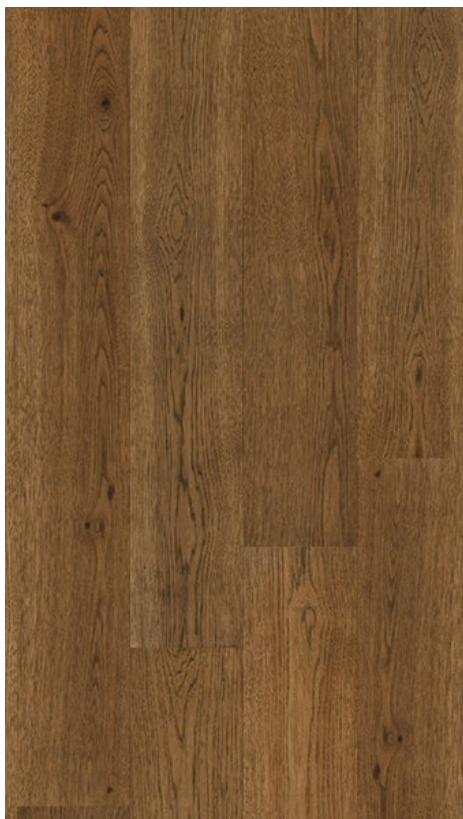
PDH663 Fort Hickory