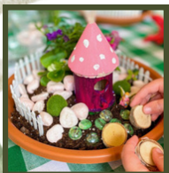
FAIRY DISH GARDEN - FOR THE KIDS! $30 per person