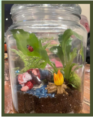
FAIRY / GNOME TERRARIUMS $60 per person