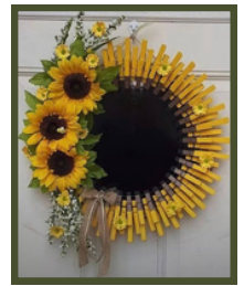
SUNFLOWER CLOTHESPIN WREATH $45 per person (July - September)