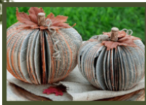
PAPERBACK PUMPKINS $30 per person (September - October)