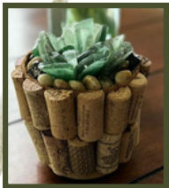
SEAGLASS SUCCULENTS $35 per person