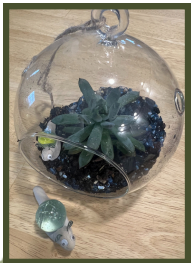
SUCCULENT GLOBE & MARBLE SNAIL $40 per person