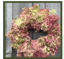
FRESH-TO-DRY HYDRANGEA WREATH $50 per person (September - October)