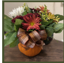
FRESH FLORAL PUMPKINS $50 per person (September - October)