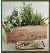
HERB GARDEN BOXES $50 per person (May - June)