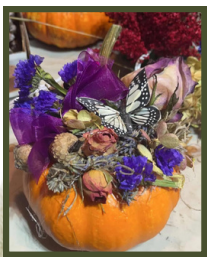
DRIED FLOWER MINI PUMPKINS $30 per person (September - October)