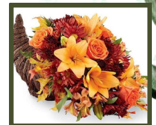
FRESH FLORAL CORNUCOPIA $50 per person (November)