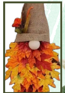
FALL DOOR GNOME $50 per person (September - October)