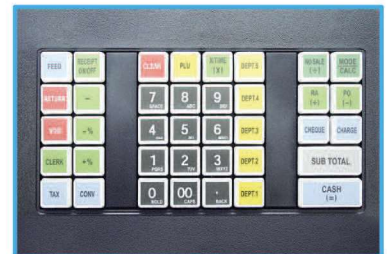
• Removeable Key Tops.