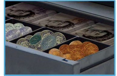
• Large or Small Drawer Option.