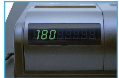
• Customer Display.