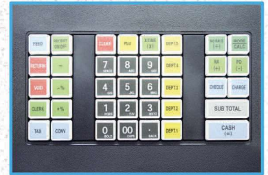
• Removeable Key Tops.