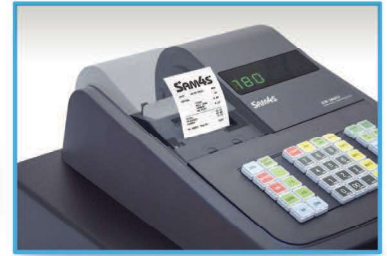
• Thermal Printer

SAM4s All now with direct thermal printers