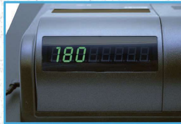
• Customer Display.