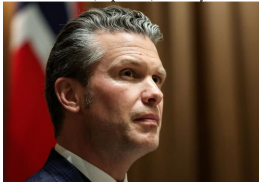
U.S. Defense Secretary Pete Hegseth