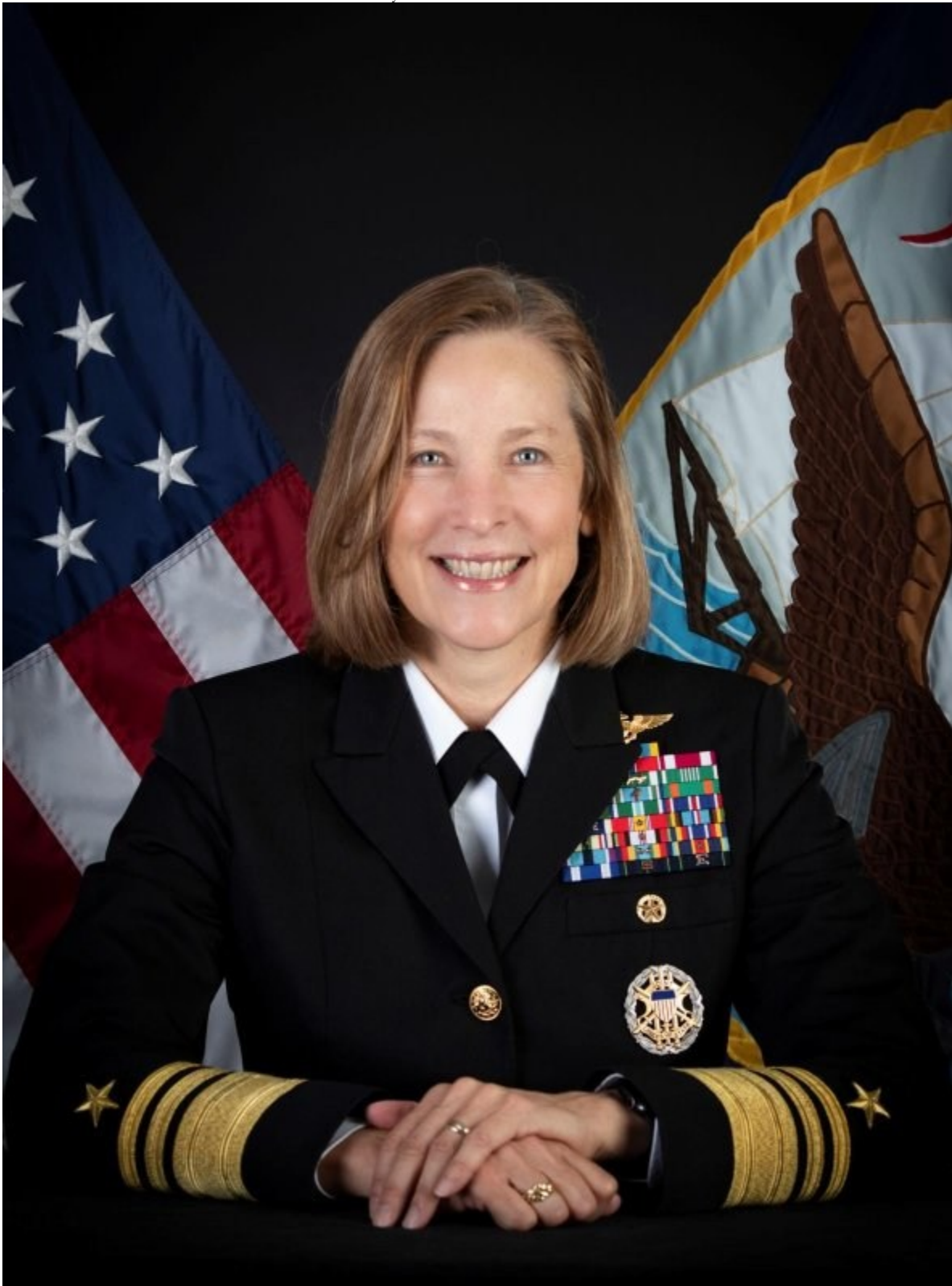
Admiral Soshana Chatfield - Continued On Page 6

the political decision-makers and NATO's military structure.