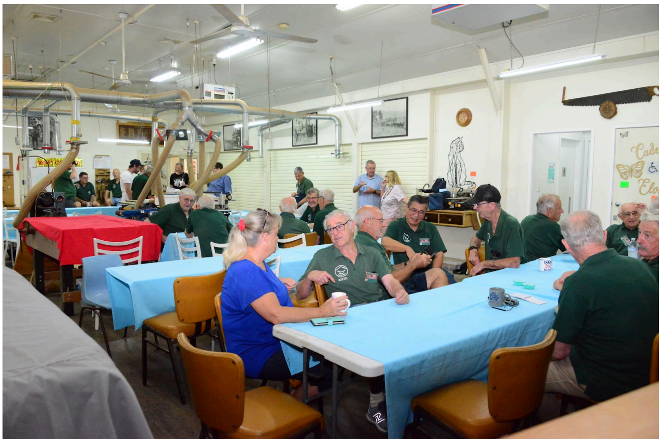
Lunch is about to be served.