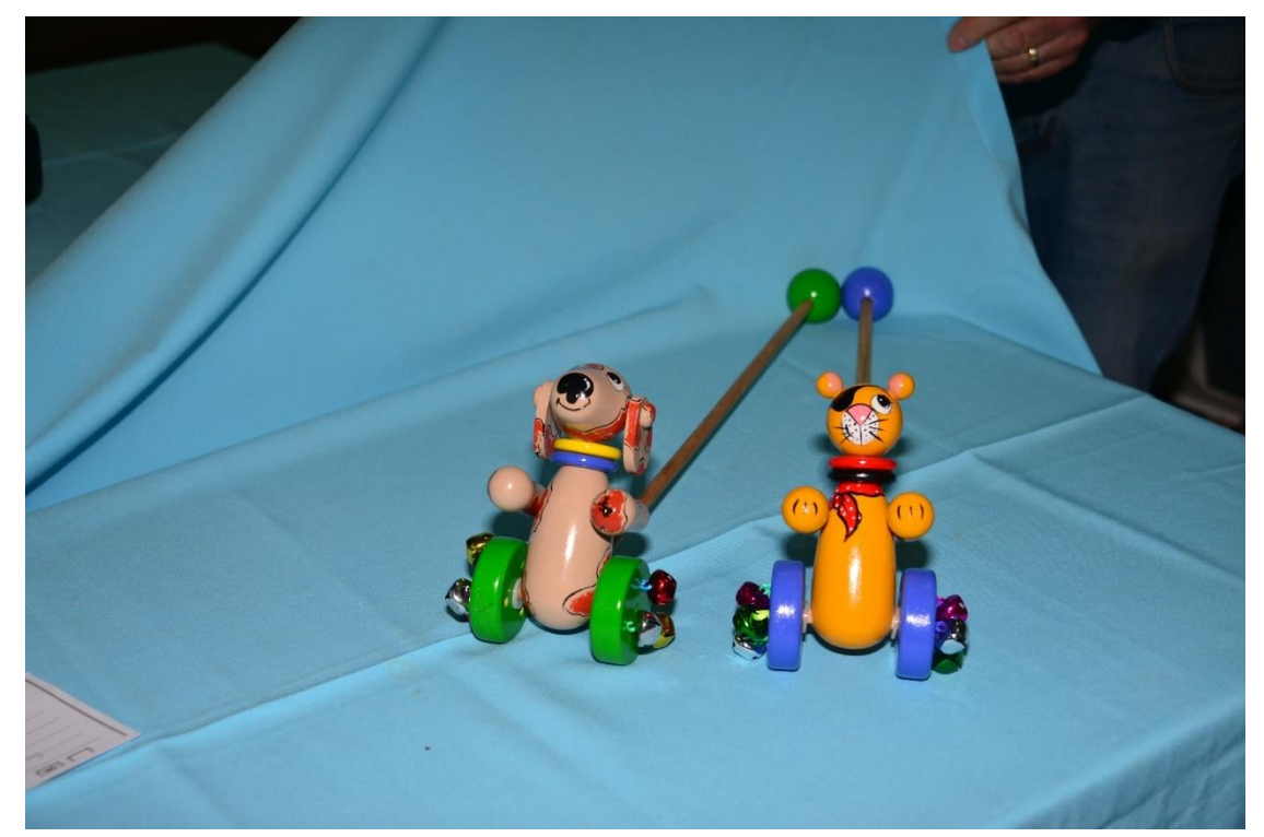
Figure 5 Push Toys by Anne and John Moss