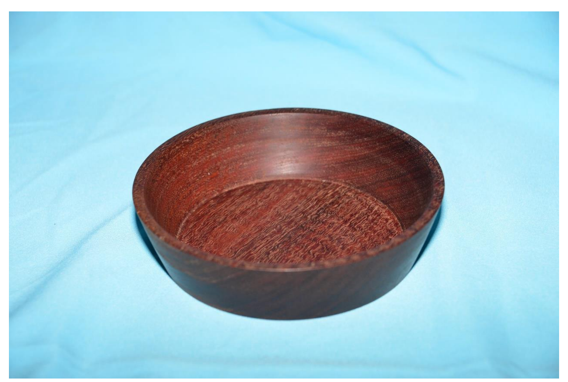
Figure 3 Jarrah Bowl by John Jansons (Best Display Wood Turning)