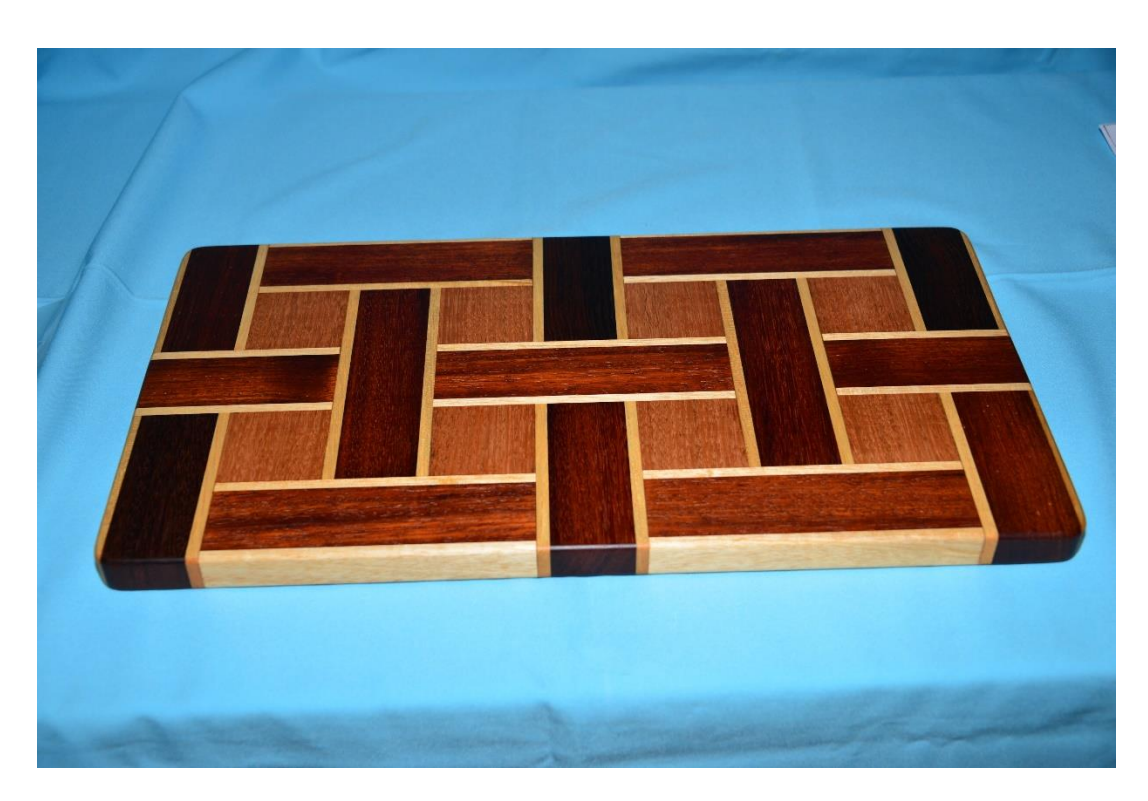
Figure 4 Cutting Board by David Johnson (Best Display Wood Working)