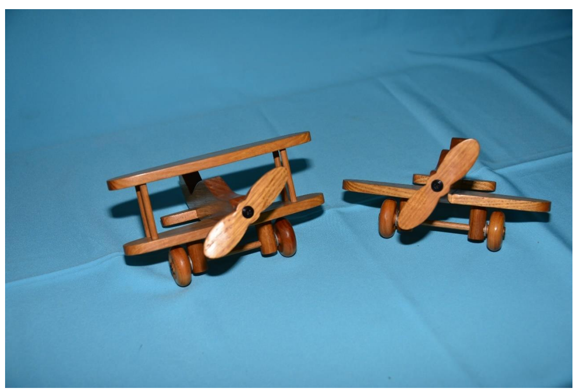
Figure 6 Tasmanian Oak Planes by John Moss