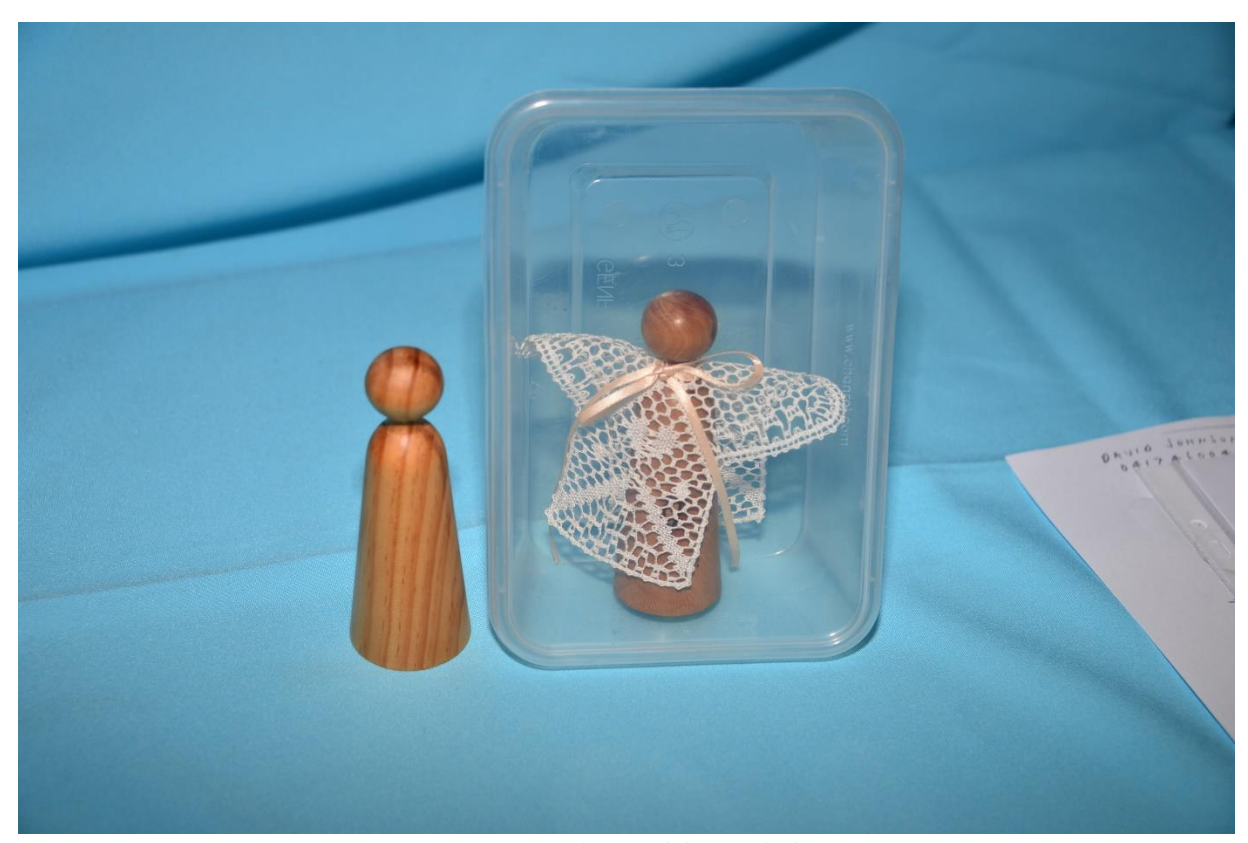
Figure 8 Lace Display Angels by David Johnson