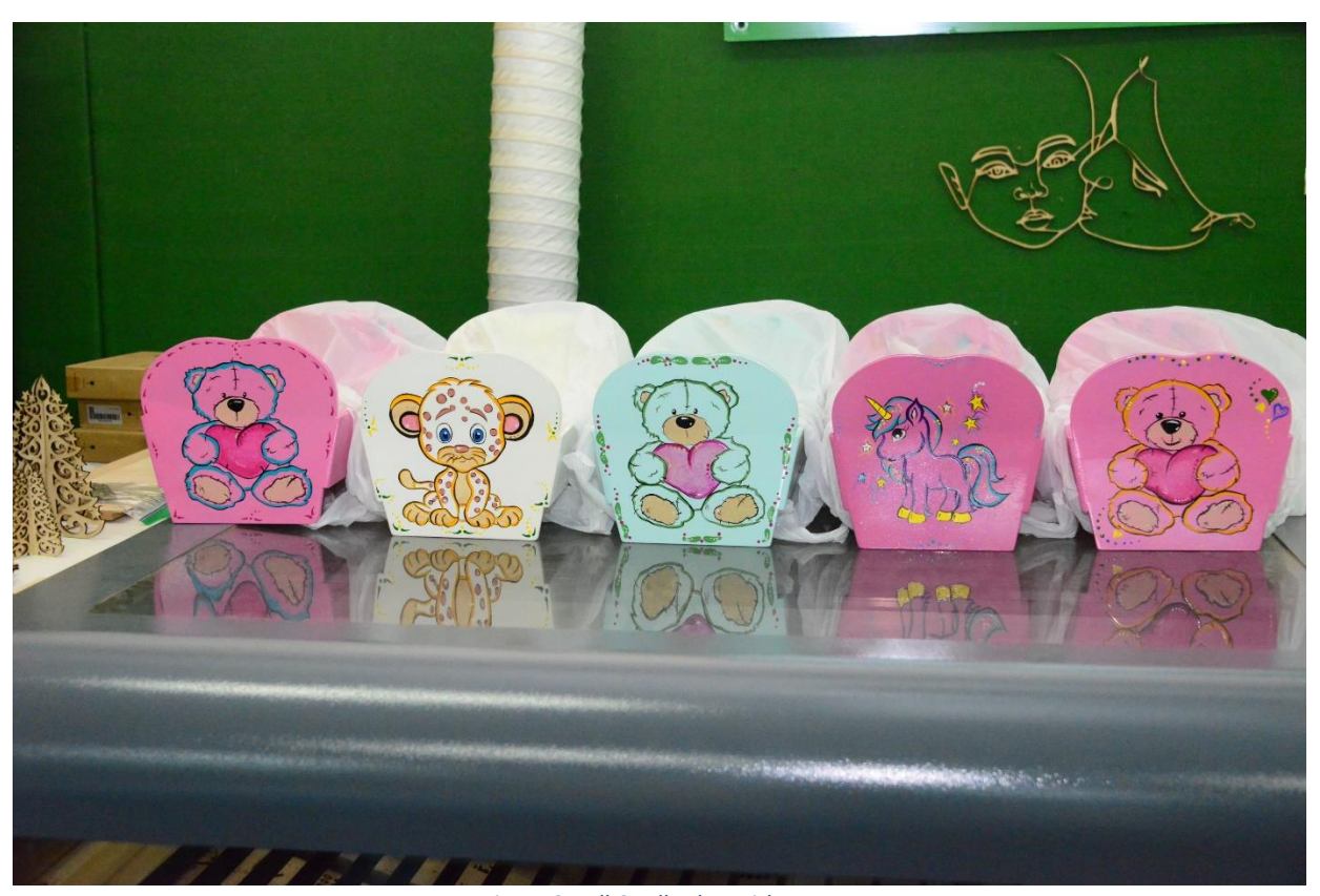
Figure 9 Doll Cradles by Keith Jones