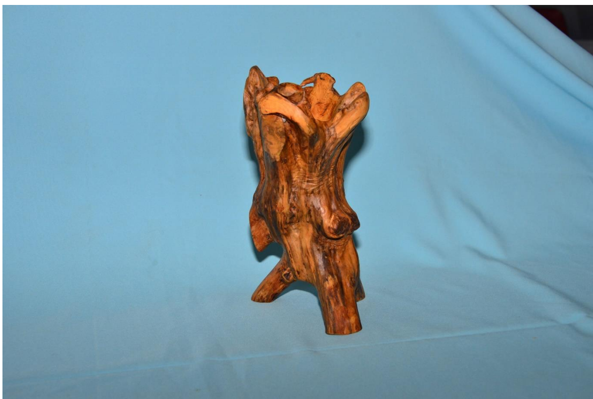
13 - Japanese box hedge root ball vase