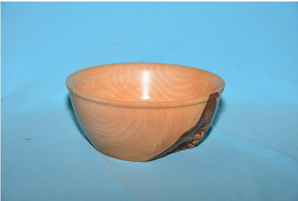
11 - Jacaranda bowl