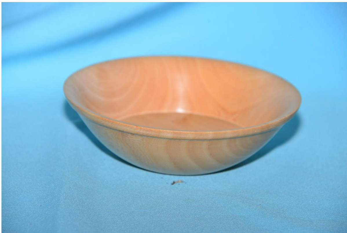
12 - Jacaranda bowl