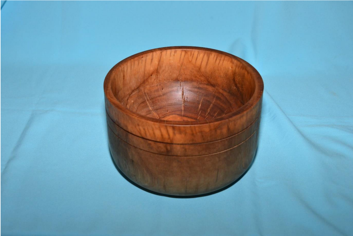
10 - Camphor Laurel pot