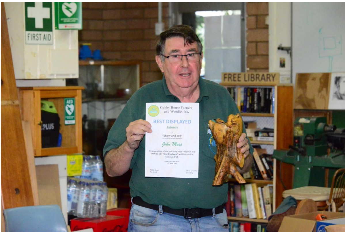
3 – John Moss Japanese box hedge root ball vase - best in display