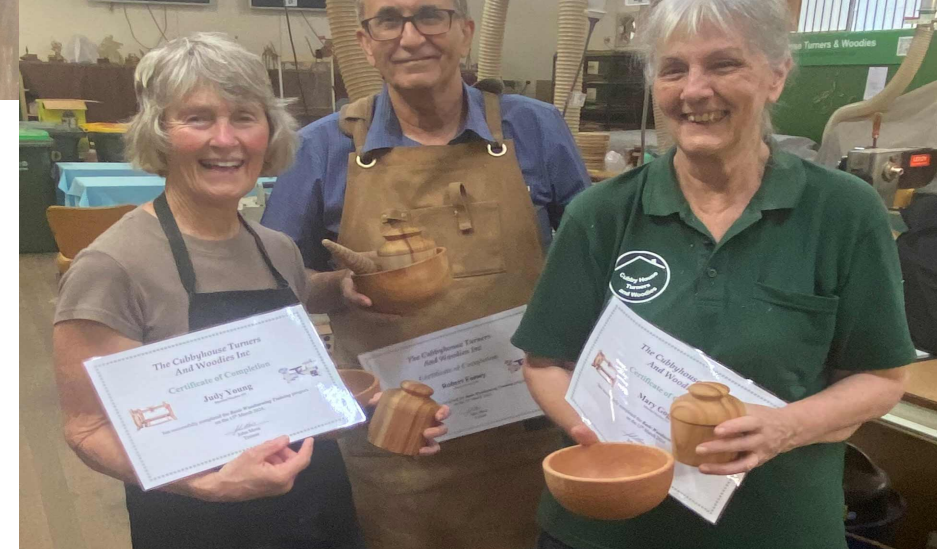
Page 3 of 13