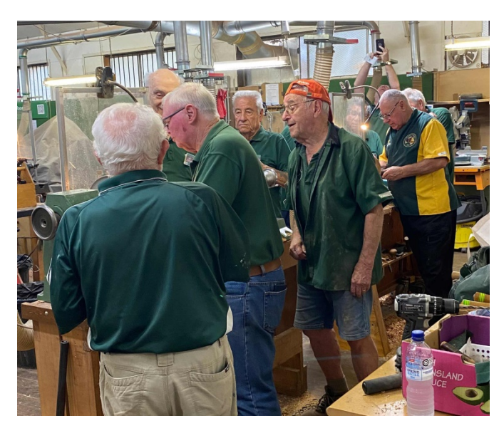
Page 8 of 13