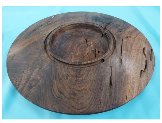
Page 7 of 13