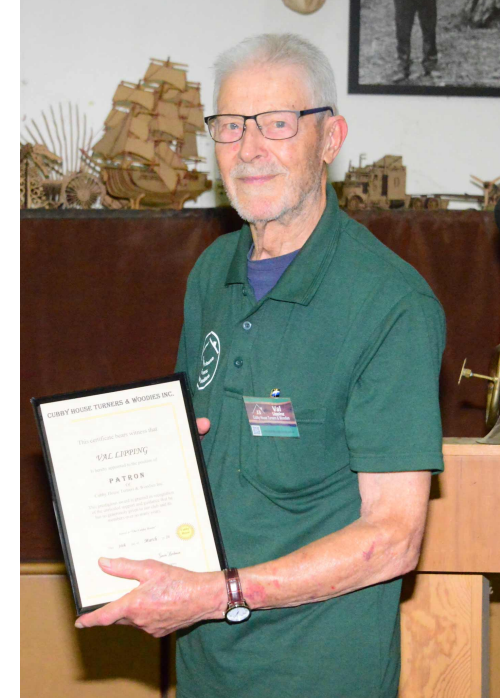
Page 10 of 13