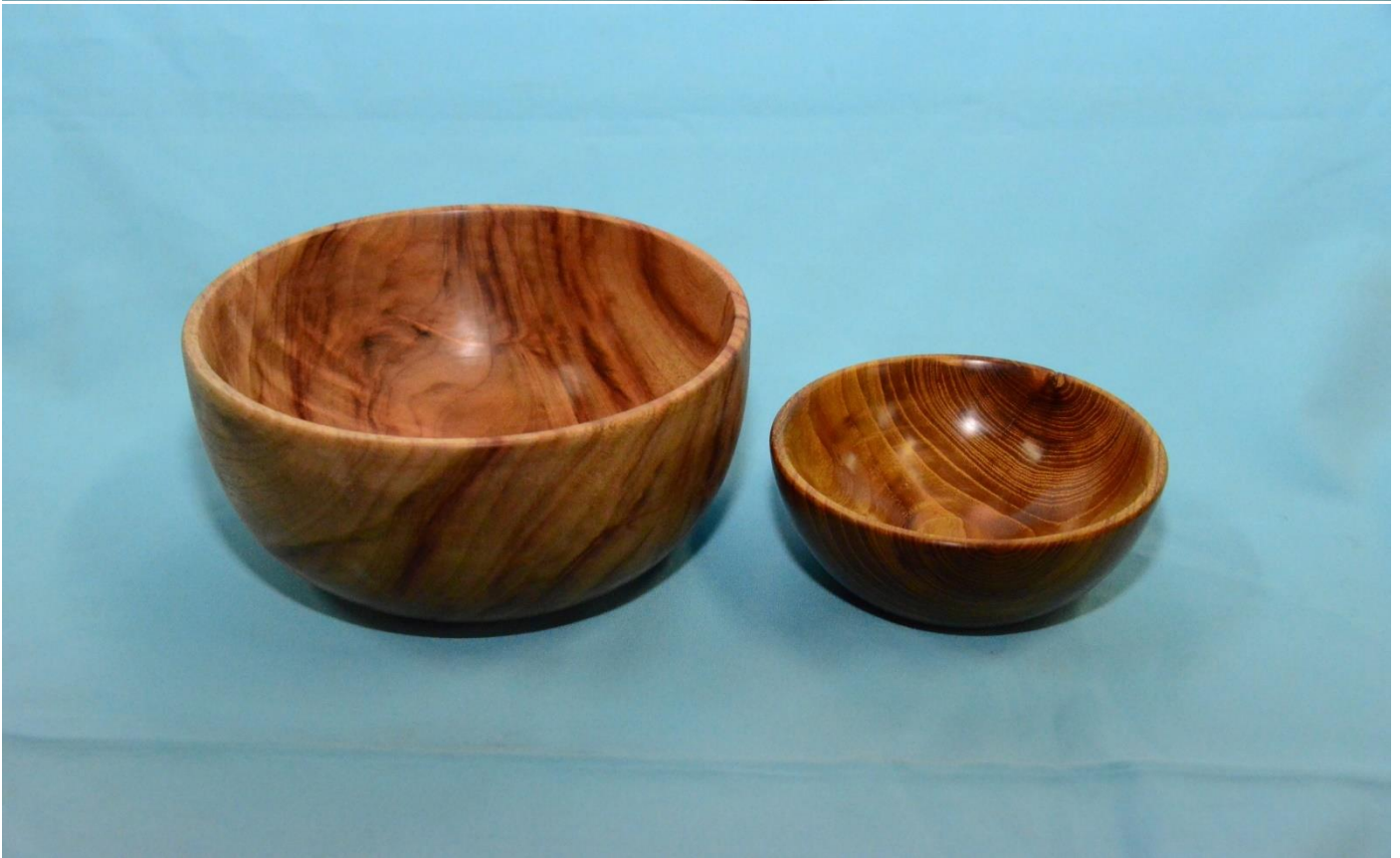
11 - Tom Hill