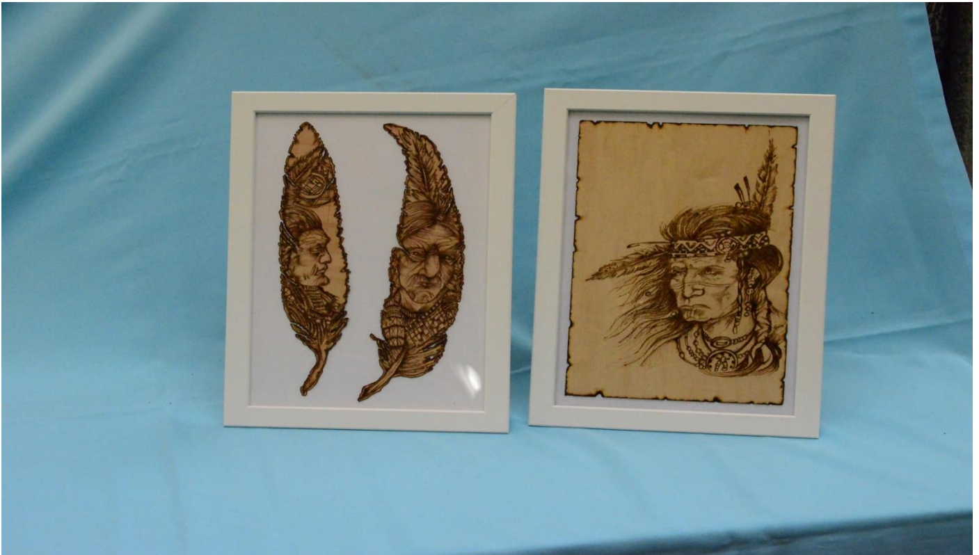
18 - Ann Moss best in show