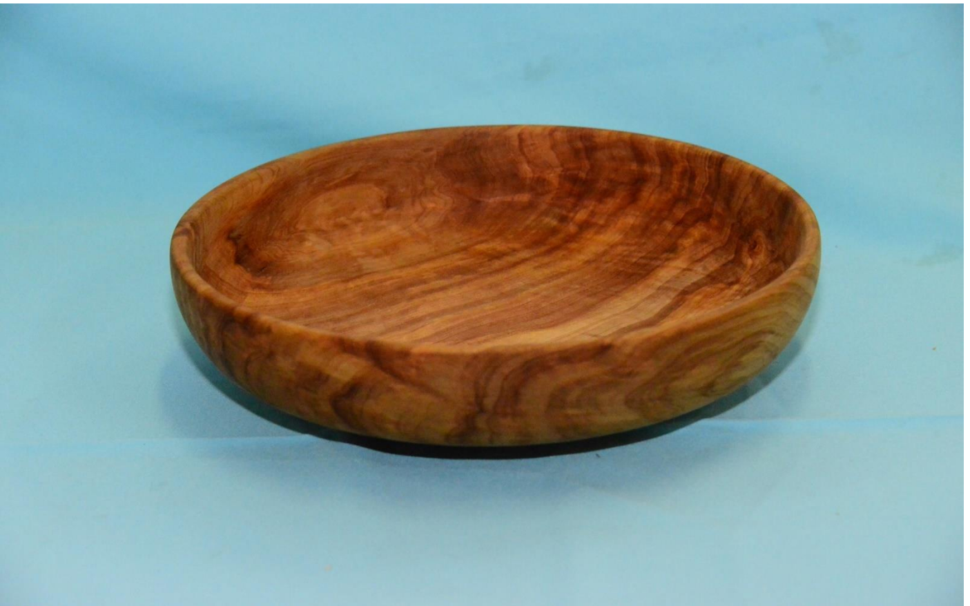
15 - George Blundell