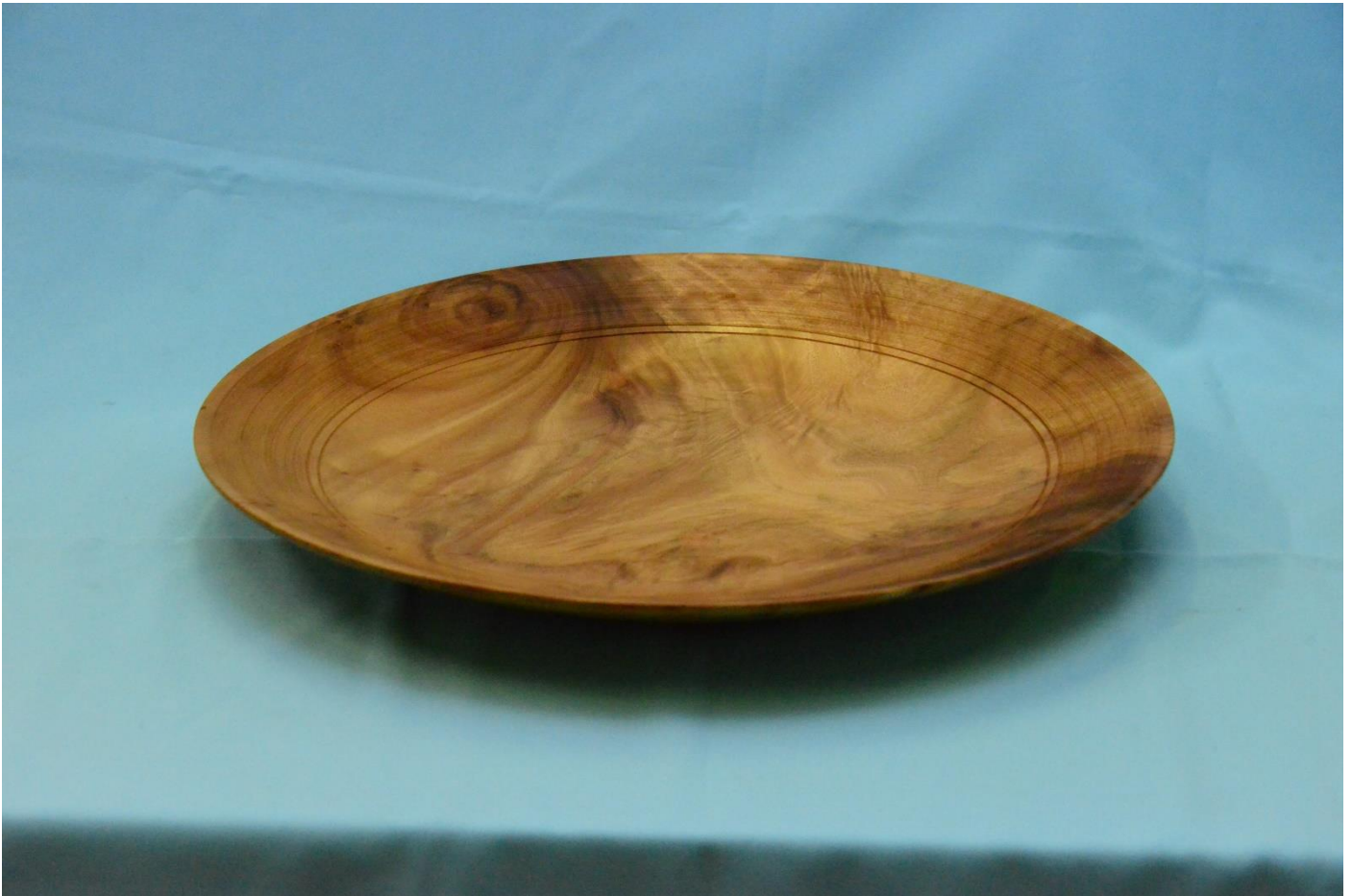
16 - Val Lipping - Best in show