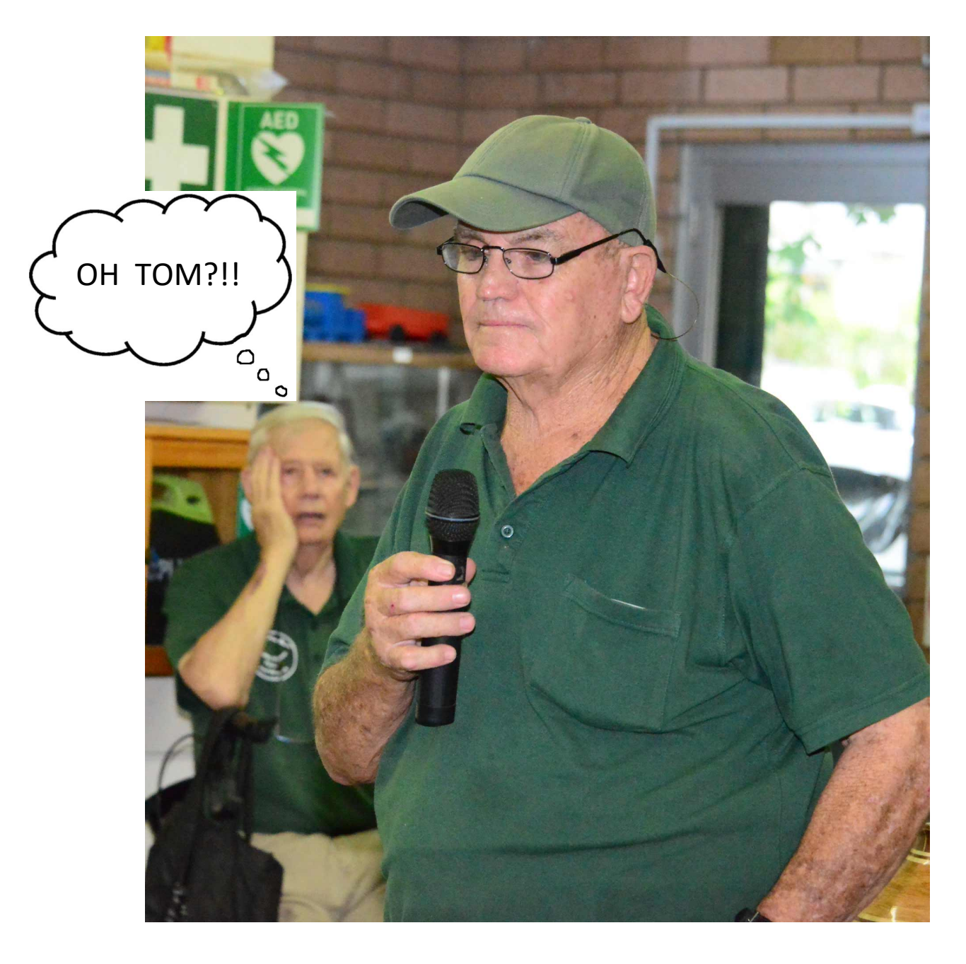
Page 6 of 12