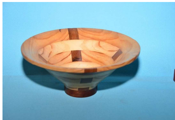
Merv Larsson – Routed Sassafras shallow bowl, Routed Tea Tree shallow bowl, Routed shallow bowls, Lathe steady, Router holder