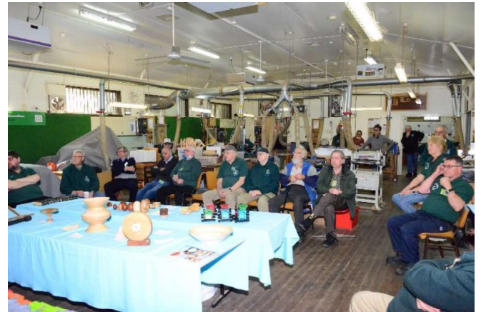
The gang listening to "El presente"