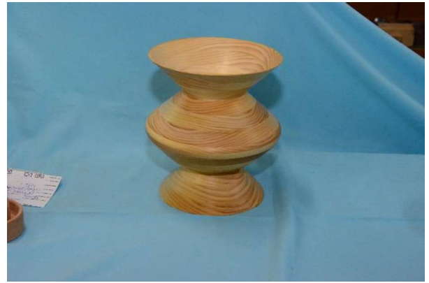
Stacked pine by Jan Westerhof