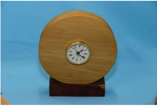
Pine clock by Jan Westerhof