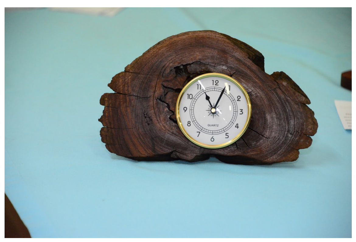
Red Cedar Clock