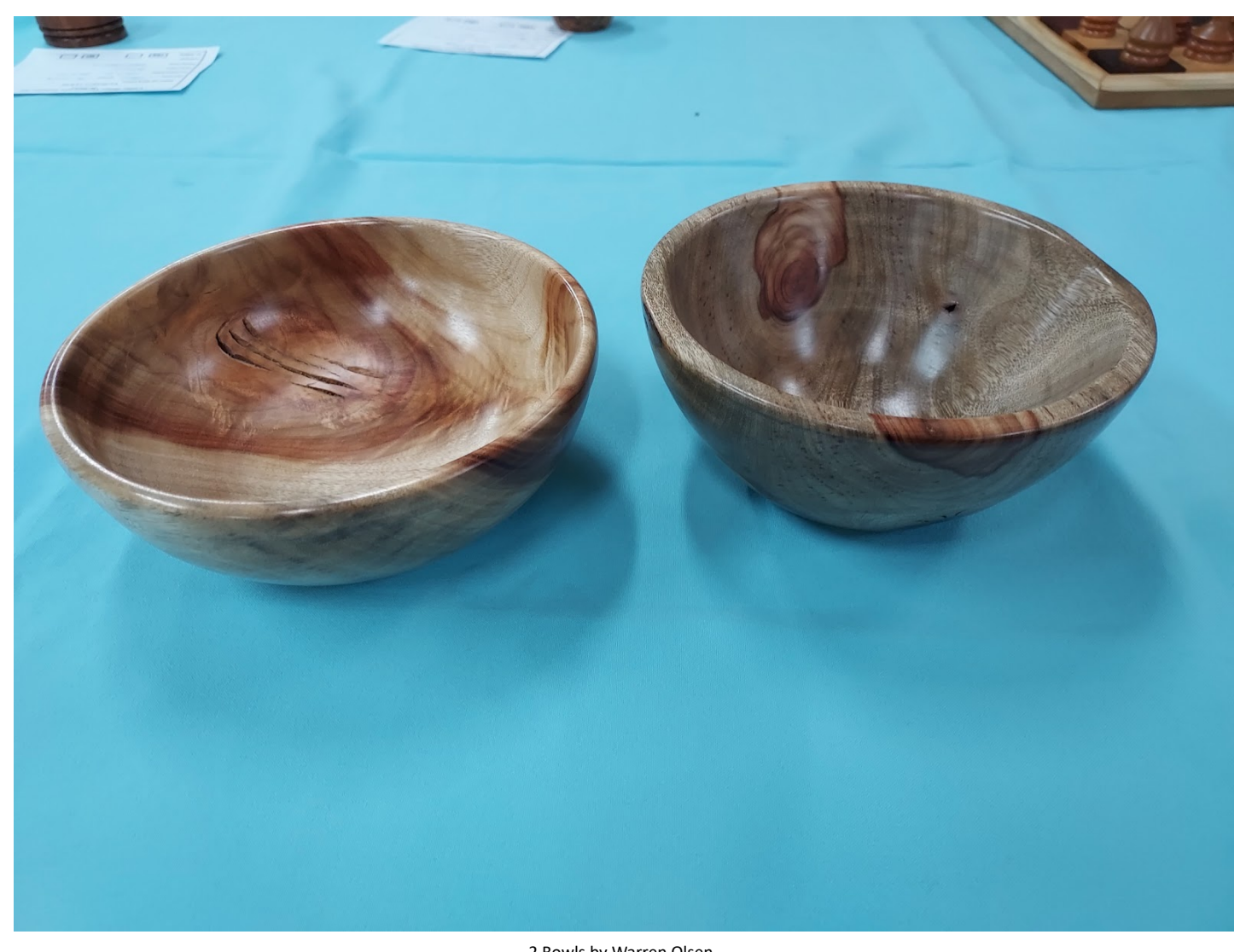
2 Bowls by Warren Olsen