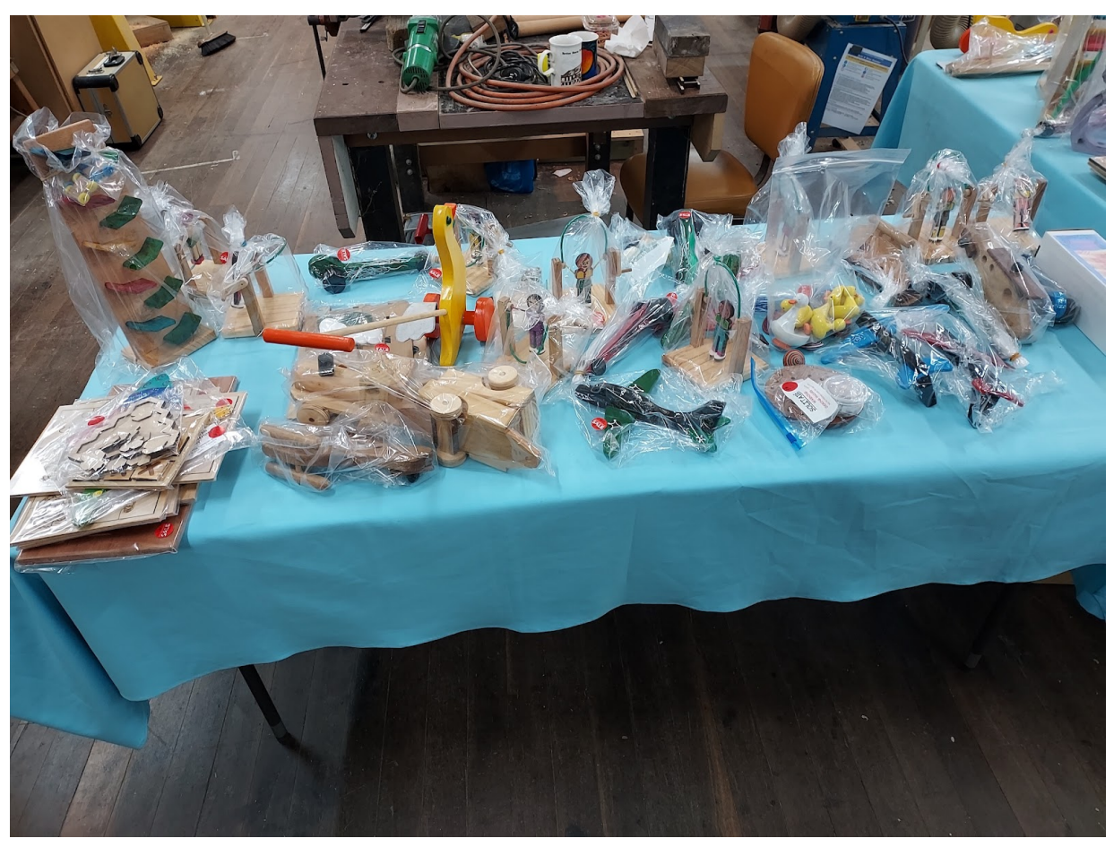
Handing over Toys to our Charities.