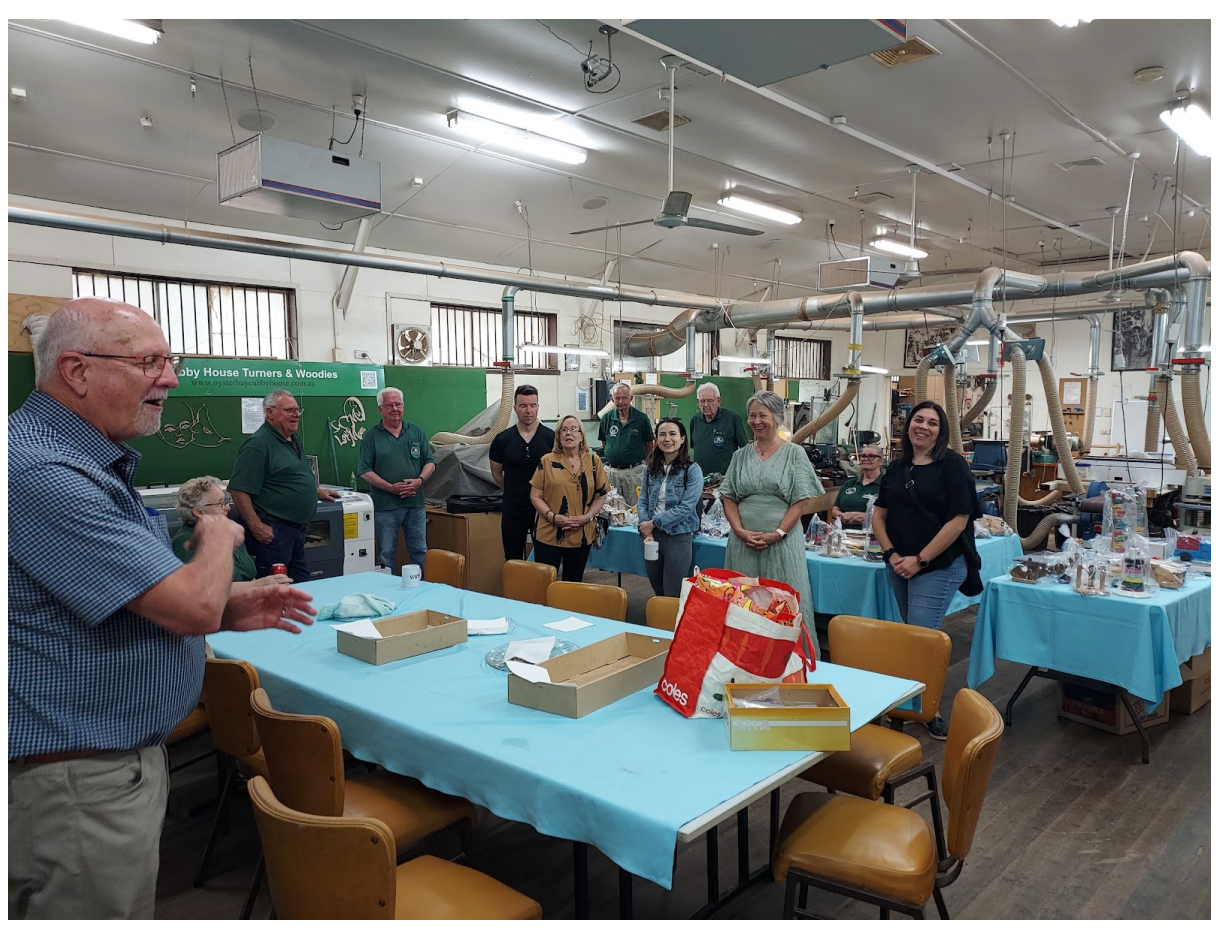
Handing over Toys to our Charities.