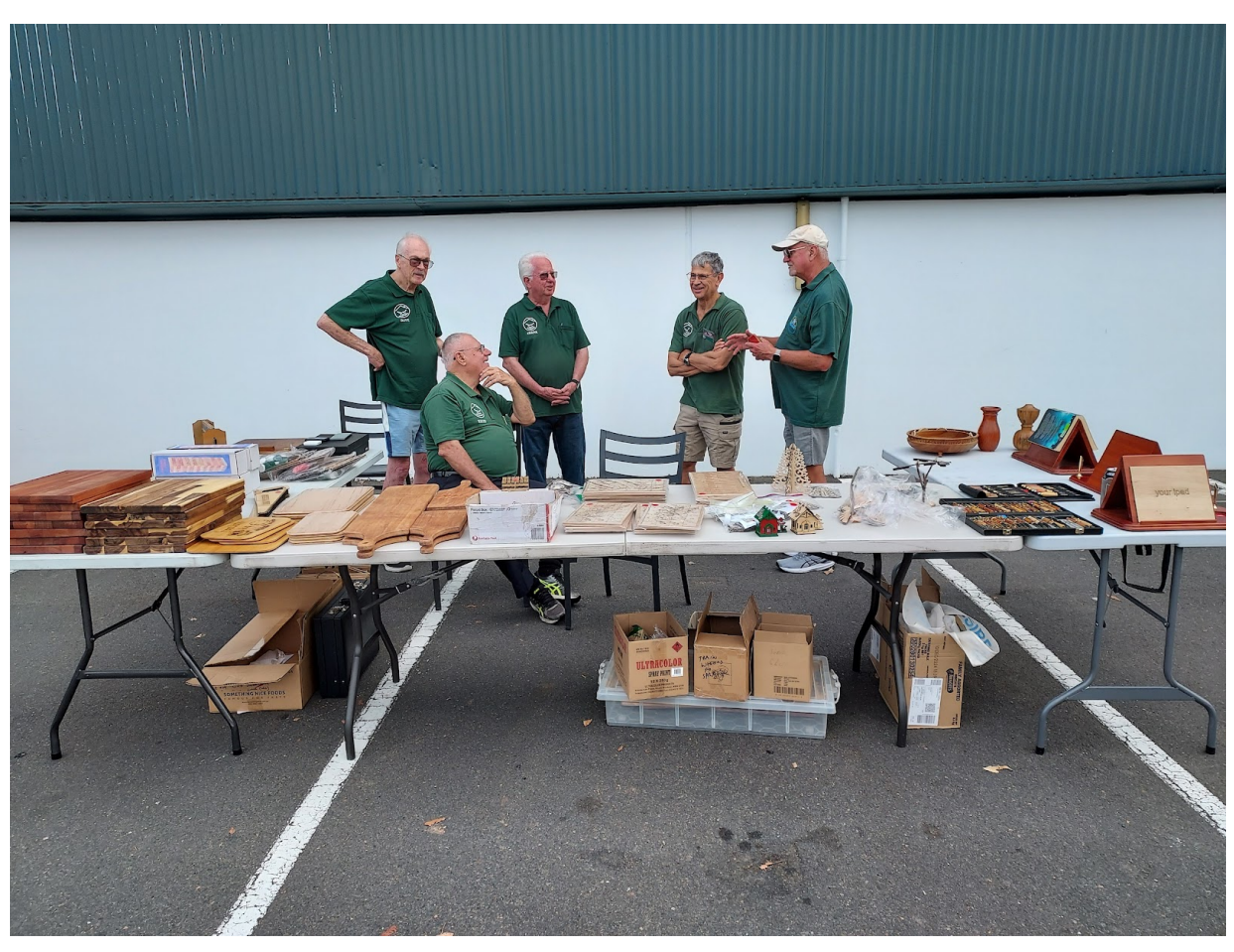
Would you buy a used car from one of these Guys????? Bunnings Christmas Markets