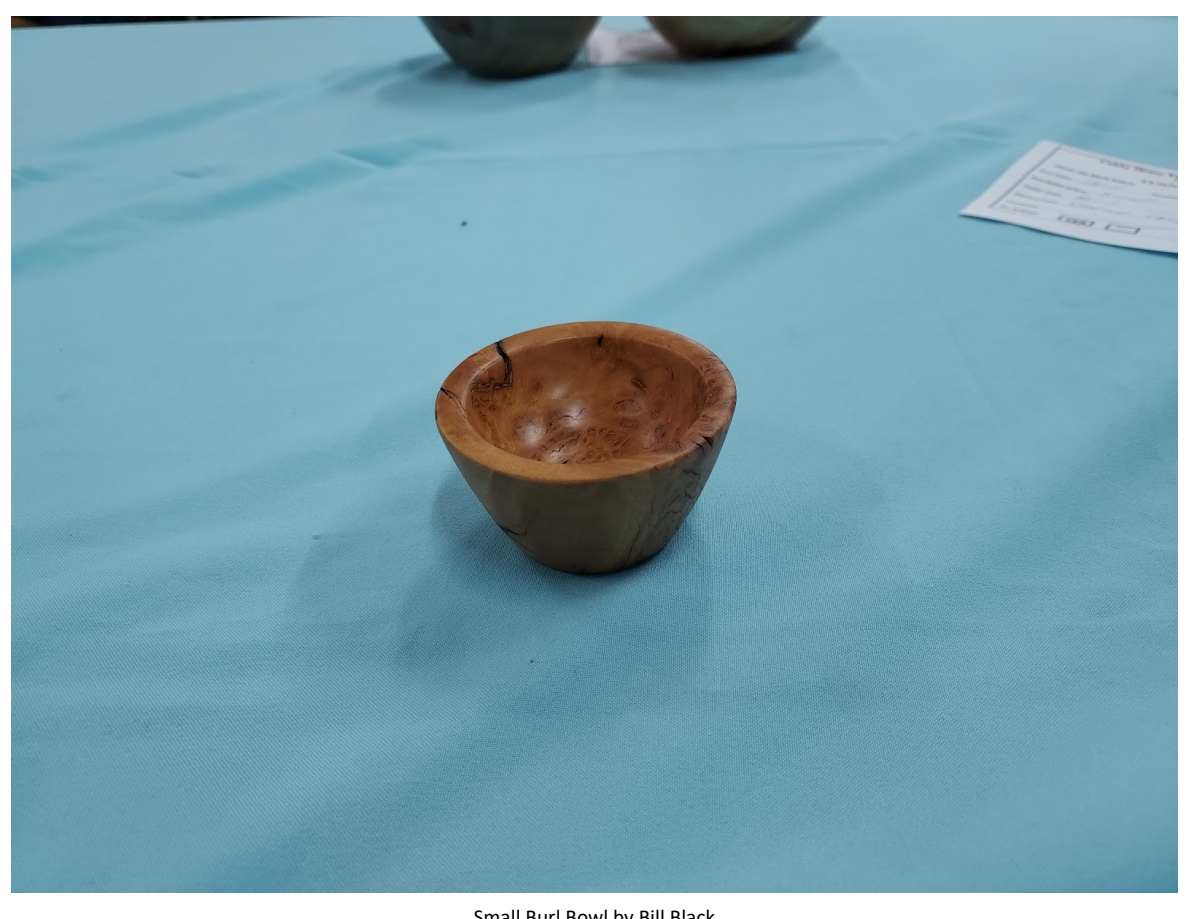
Small Burl Bowl by Bill Black