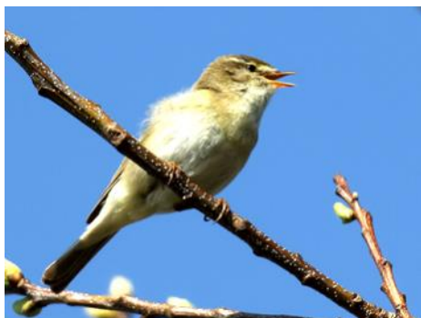
The Willow Warbler

Many forms of wildlife watching involve a degree of discomfort – Arctic cold, tropical humidity, windswept headlands or small boats in choppy seas. At this season,