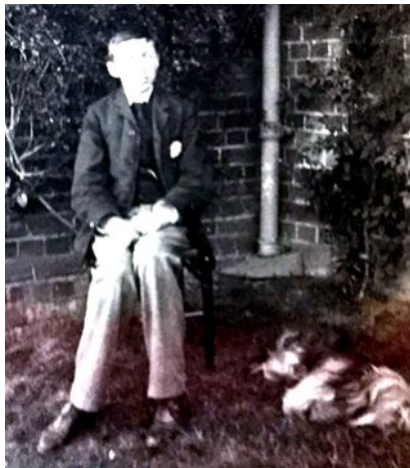
EM Forster at West Hackhurst as a boy

Forster@50: The first special exhibition on re-opening will be 'Forster@50', planned for last summer but delayed by lockdown. Commemorating the 50 th anniversary of the death of the novelist E M Forster, it is mounted in collaboration with two academics from Nottingham Trent University.