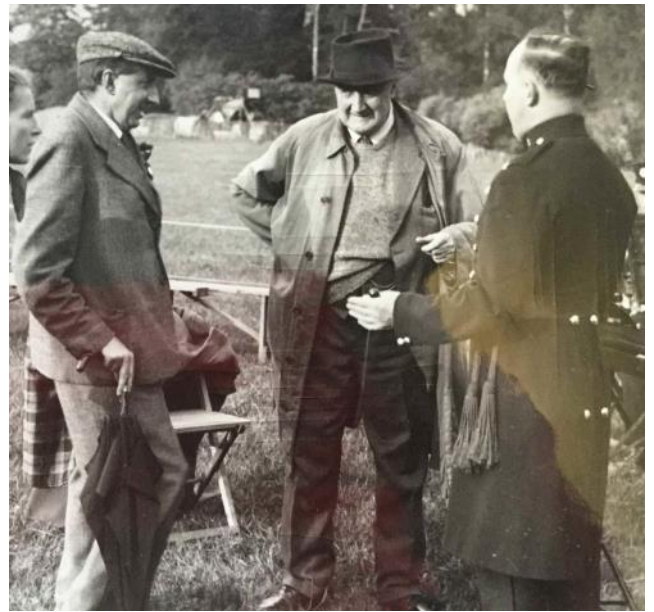
Forster, Vaughan Williams and band master during preparations for a pageant

Novelist, critic and essayist Forster is best remembered for his novels, including Howard's End , A Room with a View and A Passage to India . During his lifetime, his work was highly regarded, and he was