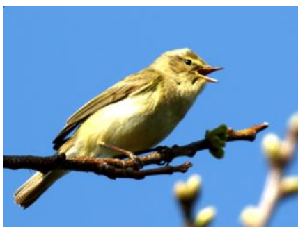
The Chiffchaff, photo courtesy of Rob Carr

Despite my opening remarks, it is worth getting up in the dark (yes, around 4 am) at least once in May to enjoy the full benefit of the experience outdoors. Wear a fleece, take a plastic bag and a cushion to sit on and settle quietly in a spot beyond the reach of the security lights. And wait.