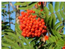
The Mountain Ash berries