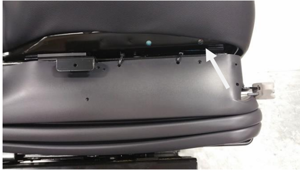
Picture1. Right side

Step 1. Take both side Plastic panel off (Not necessary if you can find it)