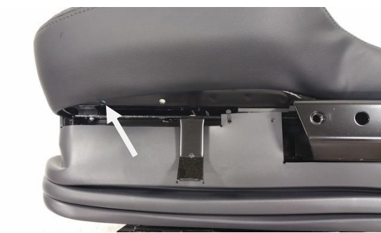
Pictue2. Left Side

Step 2. Put Narrow Driver put into both side Latch Hole(Hole with Driver in)