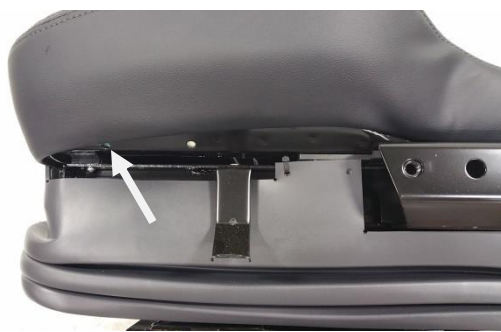
Pictue2. Left Side

Step 2. Put Narrow Driver put into both side Latch Hole(Hole with Driver in)