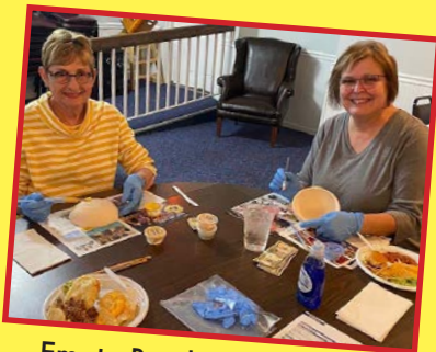
Empty Bowls for Charity!