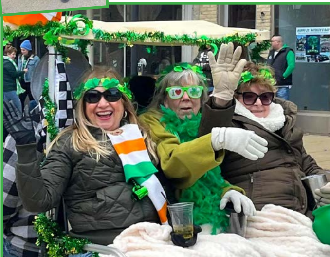
A Leprechaun and Three Green Peas in a Pod!

dinner at Roma Lodge, and Casino Nite. May kicked off with the Derby Day party on the 4th. That is a good start to the year and there are a lot more events on the calendar for the balance of 2024. A Calendar of Events is included in this newsletter.