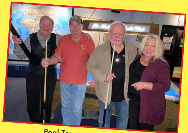
Pool Tournament Champs!