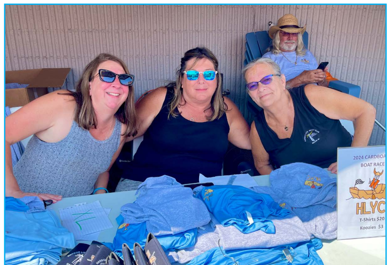
Pushing the Merch!