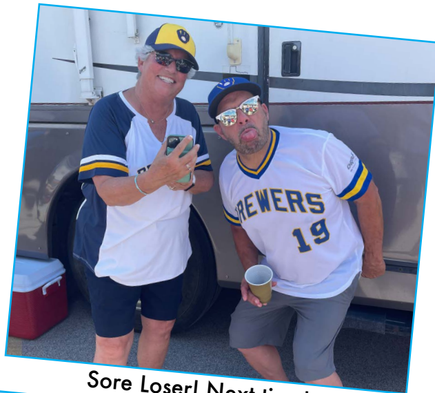
Sore Loser! Next time!