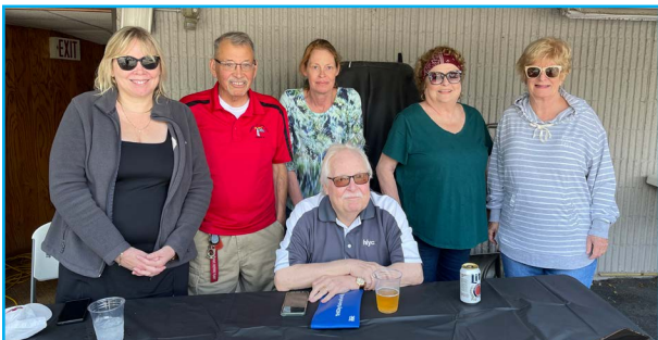
Harboritaville's Taco Team served up the spice and sass!