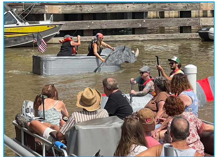
Fun Fact: Asian Rhinos are excellent swimmers!