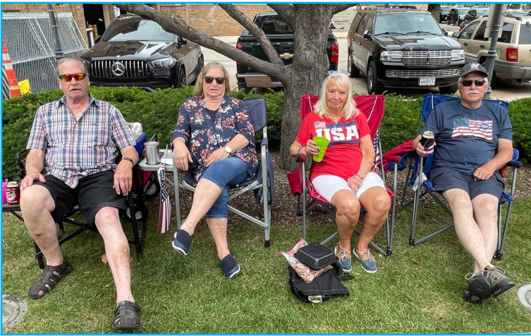
We LOVE a Parade!