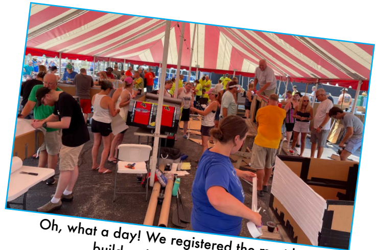
Oh, what a day! We registered the most boat builders in our race history!