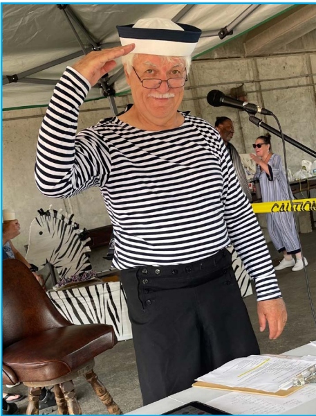
Reporting for Duty!