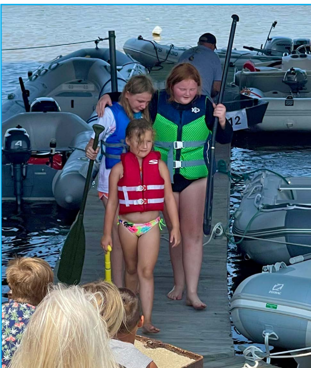
We may be little but, hear us ROAR!