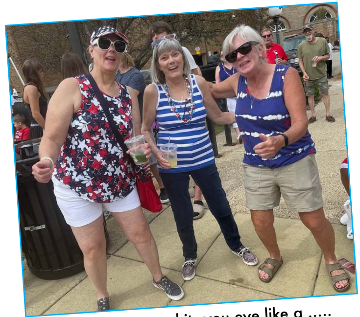
When the moon hits you eye like a ..... That's Amore!