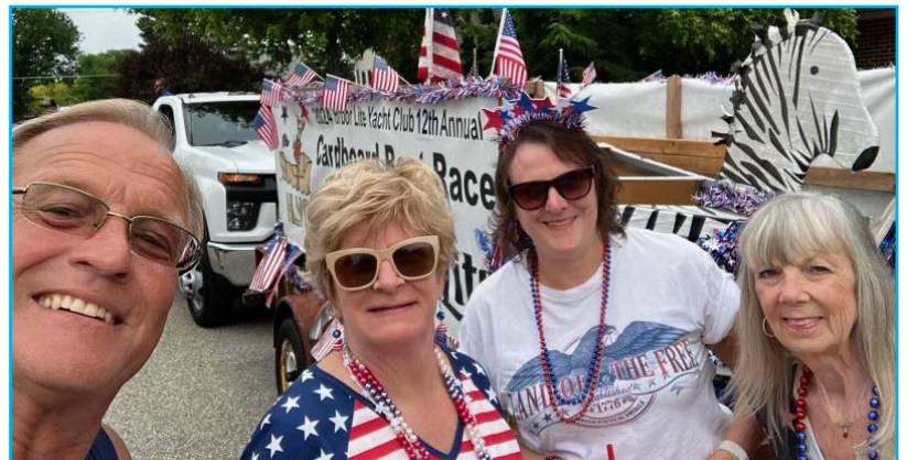
We were IN the Parade!