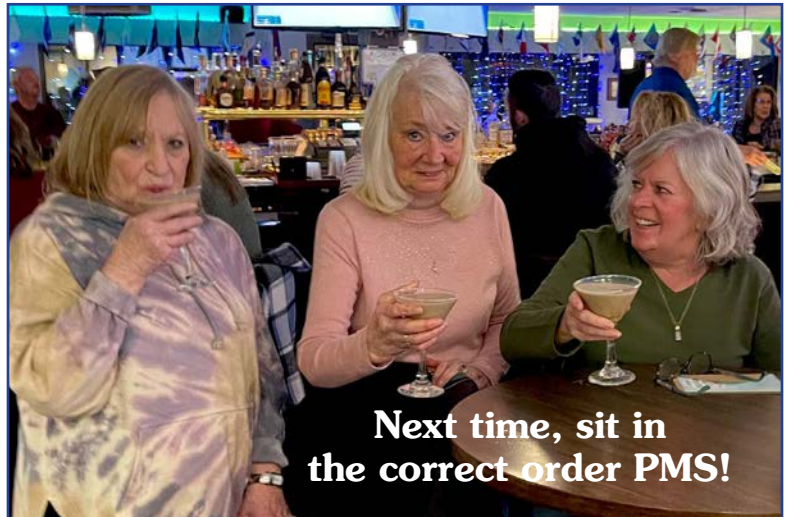
Next time, sit in the correct order PMS!