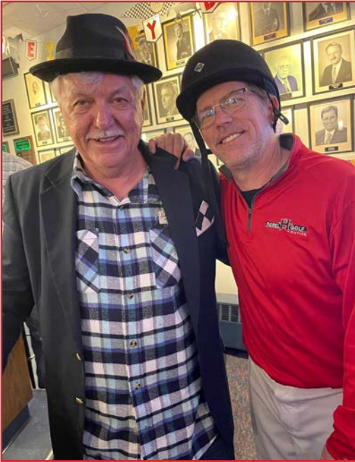
A Father & Son Reunion!