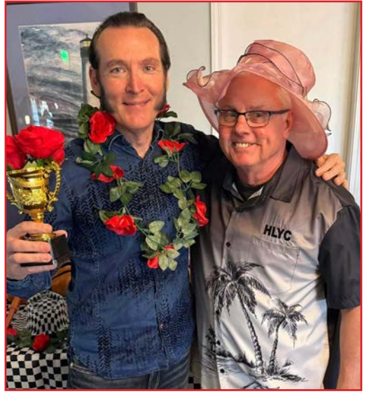
Who wore the pink hat better?