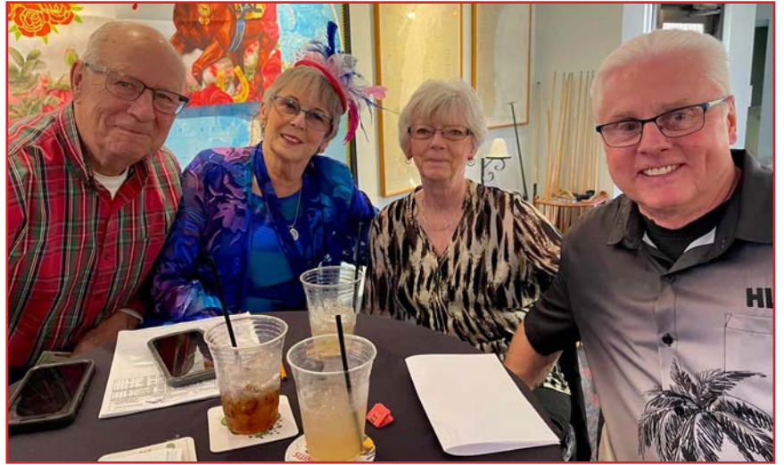
Scratched for being rowdy!