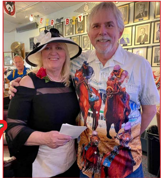
A perfect derby shirt, if there ever was!