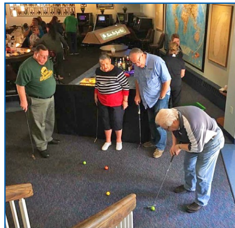
Mini Golf was Major Fun!