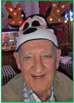
I am the Eggman, goo goo g'joob