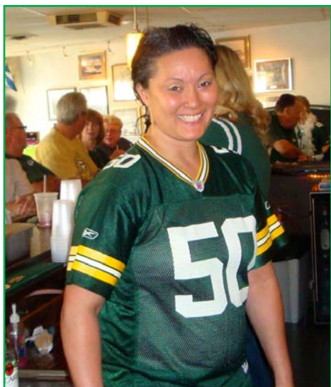
Throwback from 2009 Beacon