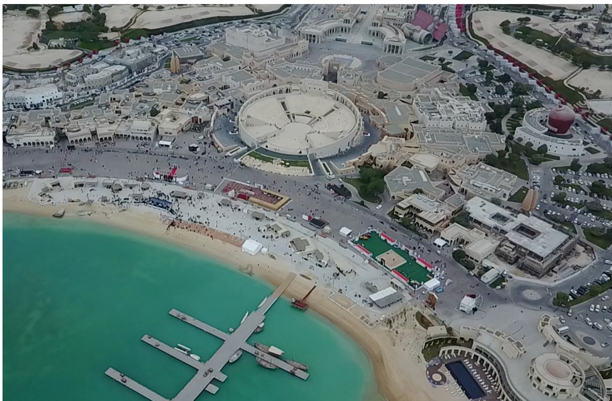
Figure 3. View of Katara Cultural Village, Qatar.