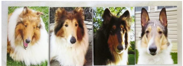
CARD SET B: Buddy, Leo, Mickey, Michael

Look at these sets of notecards featuring collies who have recently been helped by NorthEast Ohio Collie Rescue. Find out how you can obtain these colorful cards while supporting our rescue. We hope these will be the first in a series of cards as we expect the demand to be great. See the insert for details.