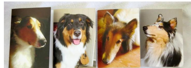
CARD SET C: Hunter, Jasper, Lassie, Storm