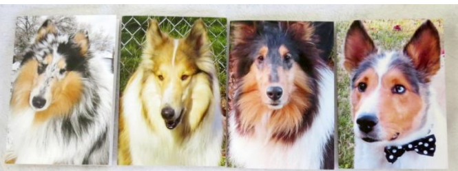
CARD SET A: Storm, Lance, Delia, Hunter

COLLIE FEST – Join collie lovers for a day in the park! Potluck Picnic, Parade of Dogs, Puppy Match, Memorial Service, Group Photo, Silent Auction. Mark your calendar so you do not miss this event. Details inside.