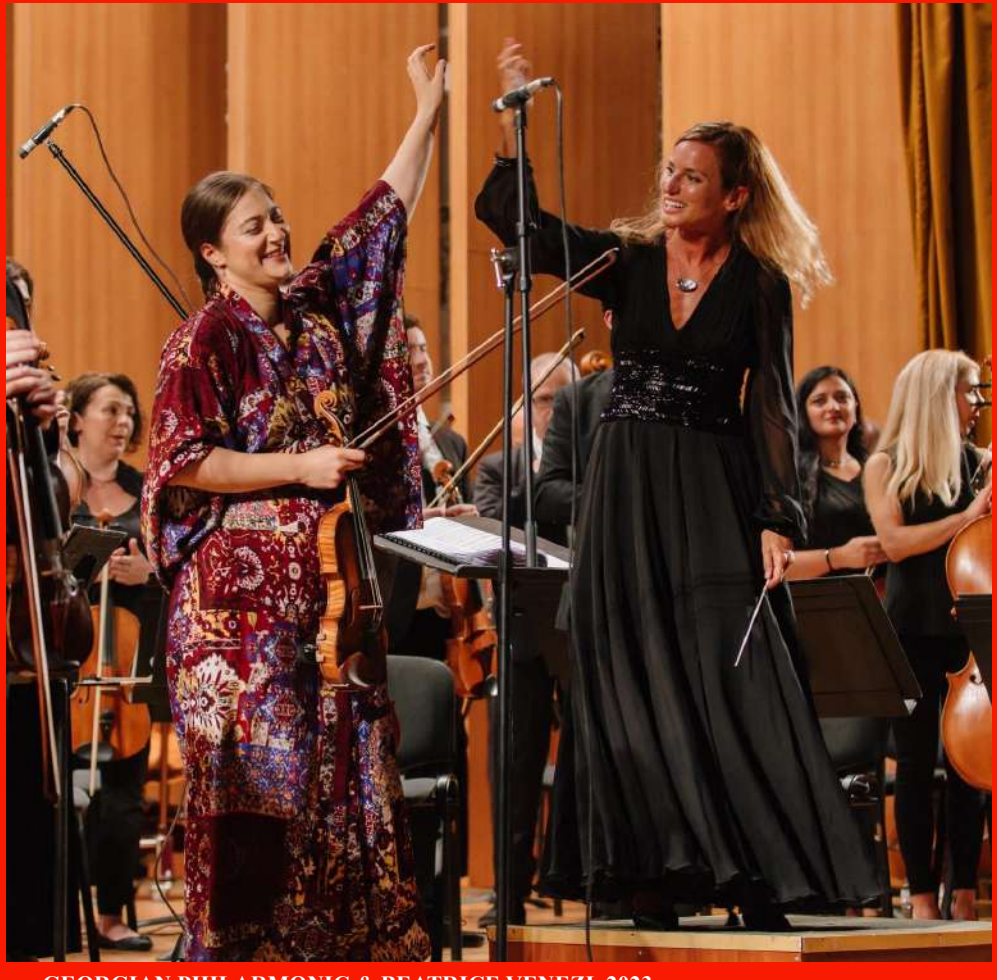
GEORGIAN PHILARMONIC & BEATRICE VENEZI, 2023