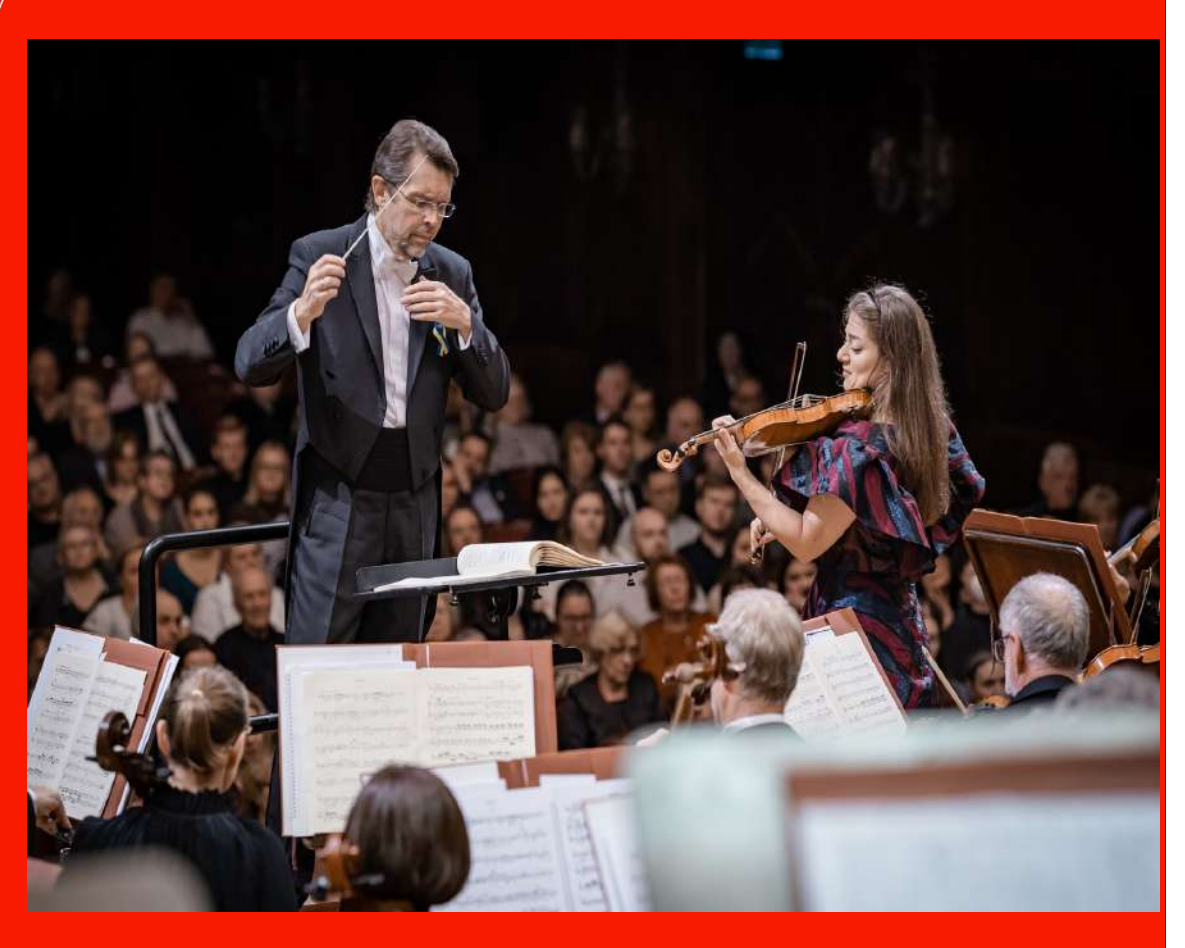
WARSAW PHILARMONIC & ANDREY BOREYKO, 2022