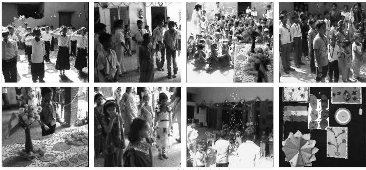
Some Glimpses of The Little Keb Schools

The Little Keb-School is a project of IGEP Trust for the children of the disadvantaged social segments in Delhi. It was established in 2003 with a mission to provide the children from deprived communities with basic education, healthcare and hygiene, clean clothes, food and a happy life. The mission and vision of the school is 'Basic Education for All'. The Little Keb-School has been striving hard to develop the children from poor societies through its educational and vocational programs. Because of its systematic and efficient work it has been supported by the Rotary Club of Delhi Midtown. Further, companies working with IGEP and friends have also given a helping hand. The Little Keb School has become the reference project for three more schools, a small health centre and vocational training activities in the mica mining belt of the state of Jharkhand. Here the pharmaceutical company Merck from Germany agreed to follow the IGEP concept of helping the poor in these simple ways. The schools are located in the villages of Panchrukhi (Dhanbad Dist.), Barkitand (Giridih Dist.) and Sapahi (Koderma Dist.) in the state of Jharkhand.