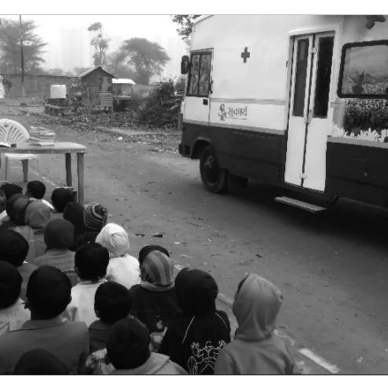
Children learning alphabets