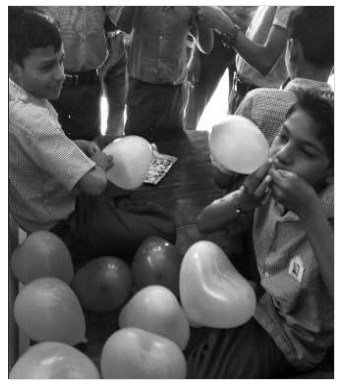
Students blowing up balloons for decoration

Teacher's Day is celebrated in India on September 5. The