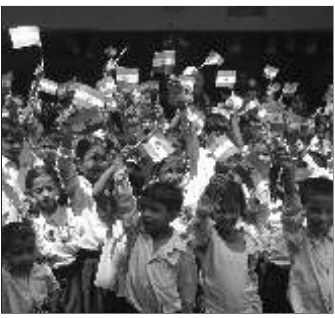
Happy faces of students