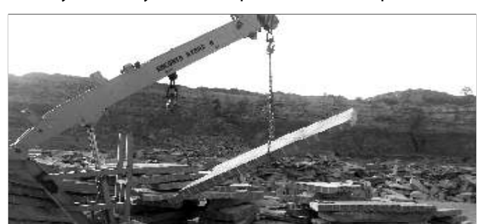
Transportation of Stones

The social and environmental auditing and certification of natural stones is offered by IGEP, for whole India. IGEP already has 25 years of experience in the production