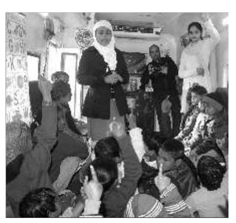
An activity in the class