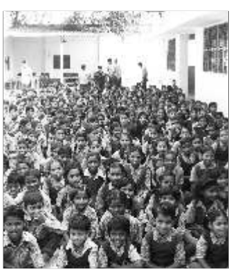
Students eagerly waiting to surprise their teacher