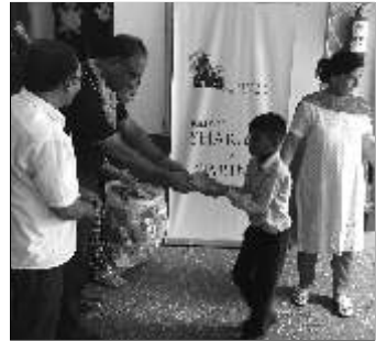
Distribution of food hampers