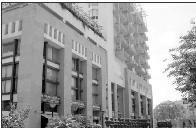
(The Peach Tree Complex, IGEP's New Office)