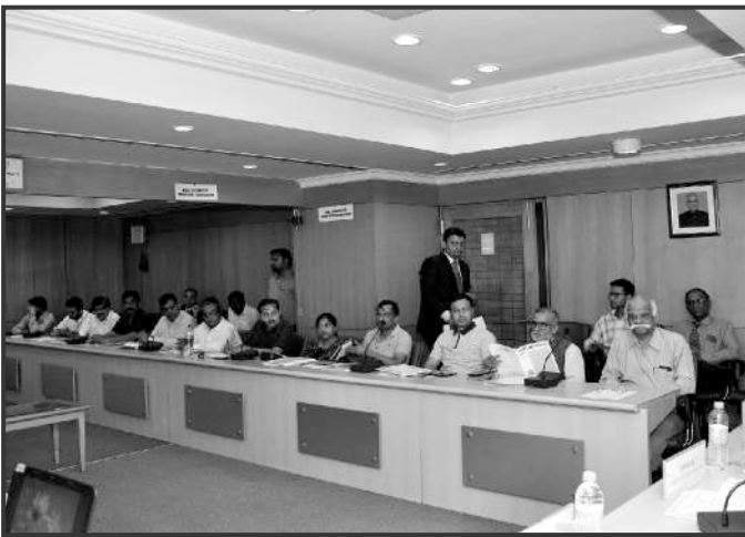
(Interactive Session on Doing Business with Bulgaria)