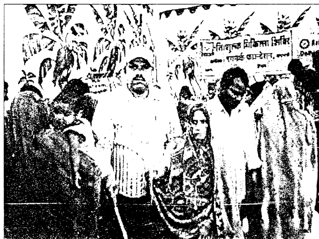
Rugmark worker assisting an old lady at the Rugmark health camp.

During the past few years, RUGMARK schools' staff has been participating in polio immunisation programmes. The district administration appreciated the dedication and sincerity of the RM staff. RM schools, at various occasions were identified as best centres at block and district level by the administration. More than 2000 children are administered polio drops in each phase of the programme in RM schools.