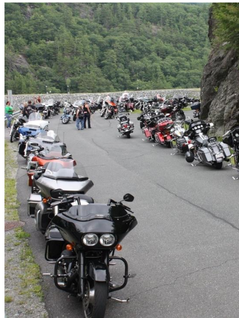
Almas Ride 2017

There are some good rides planned as usual, along with returning favorites like Rolling Thunder, The River Run, Alma's Ride, Daytona, (spring & fall), Laconia, & Americade.