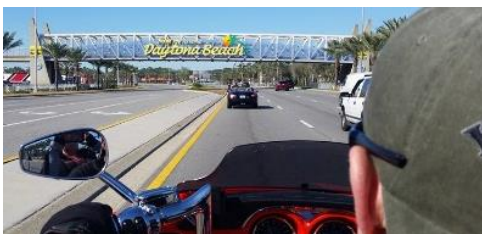
Daytona Bike Week 2015

Hello Adirondack HOG! Spring is only 5 weeks away! Less than 1 month till Daytona Bike Week! Some of our members are already in Florida enjoying 80-degree days.