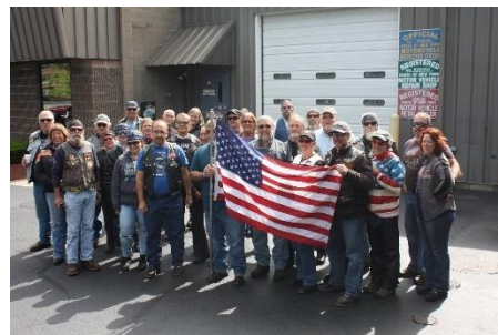
Nation of Patriots Ride 2017

I'm sure that the Nation of Patriots Flag Ride will happen again this year, also.