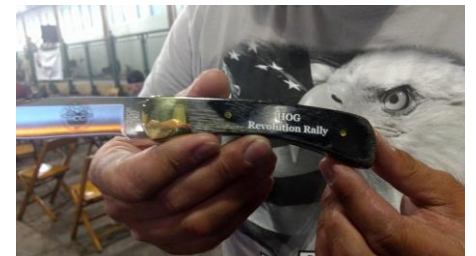
HOG Revolution Rally 2017

Rooms for the Iron Adventure in Sunday River Maine are also filling fast.