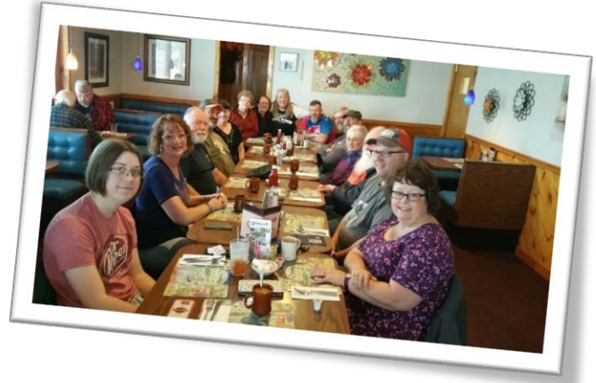
Brunch at the Peppermill 2018