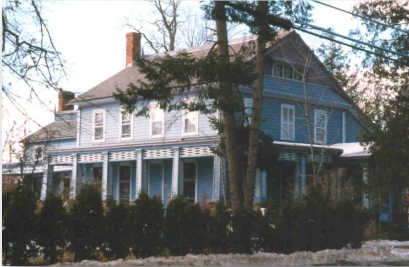
At left: Gibbs House, Greenwich, NY