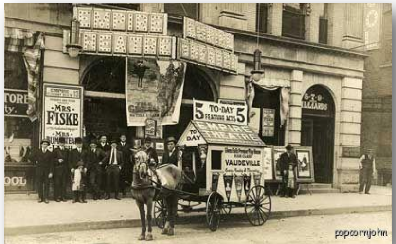
Empire Theatre on South Street in Glens Falls. Circa 1900