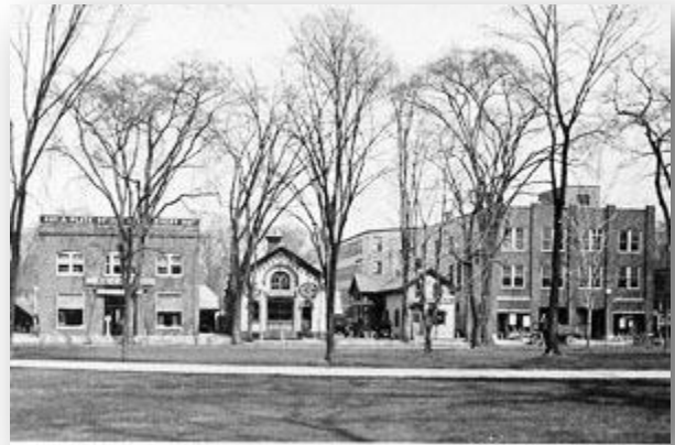
City Park looking north...”Then and Now”!