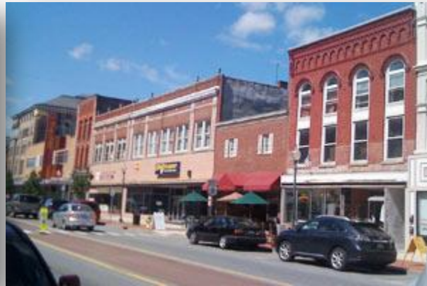
Downtown Glens Falls...East side of Glen St... Then and Now!