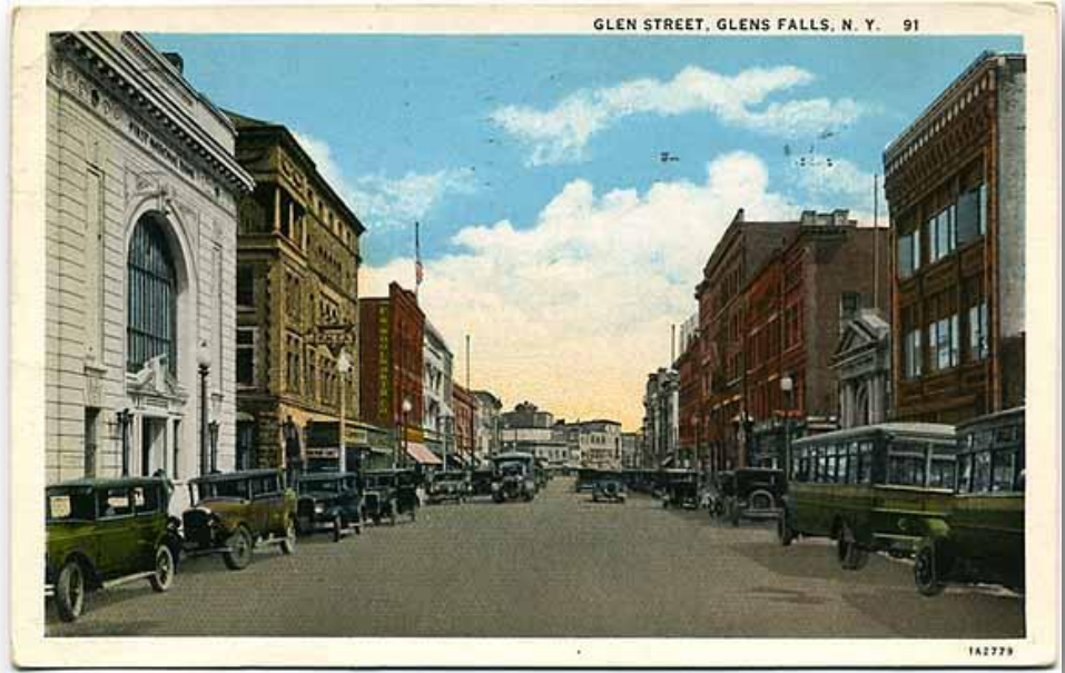
1932 Glen St in Glens Falls..old postcard!