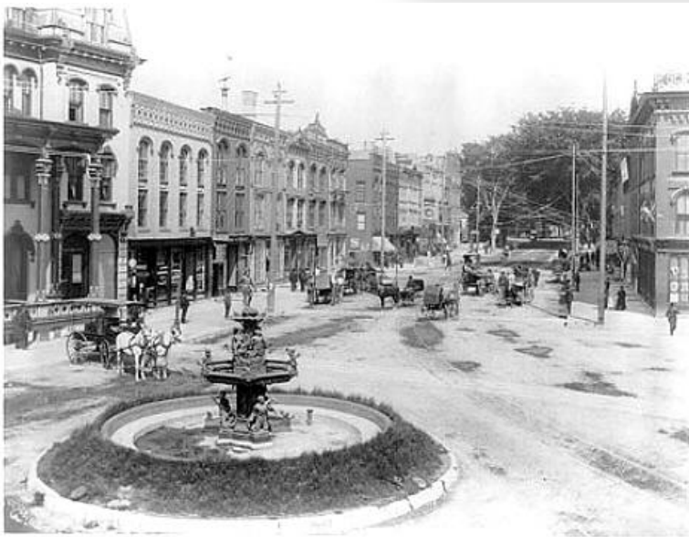
Very old photo (undated) where the traffic circle is today corners of Ridge St, Warren St, Glen St etc looking north..