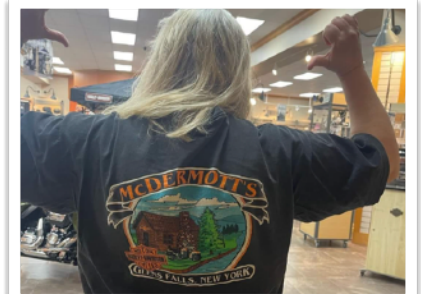
Cabin Fever 2022