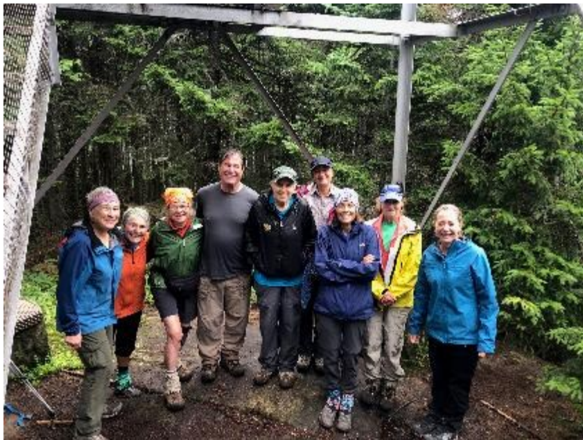
Vanderwhacker Mountain Fire Tower