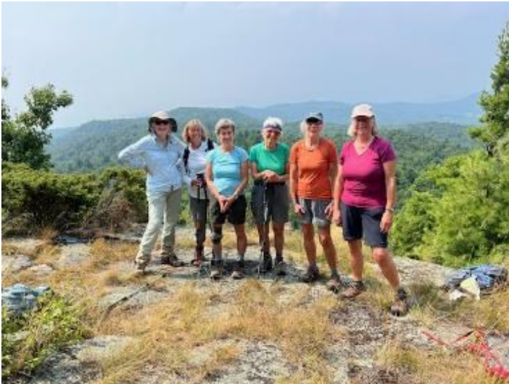
Ore Bed Overlook