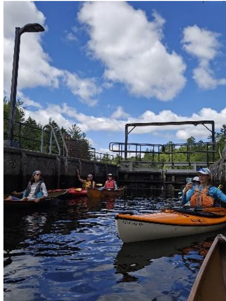
Saranac River Lower Lock

All eight of us piled into the lock together, the gate was closed behind us, and we were lowered down hanging on to ropes on the walls. It was fun. (There is a canoe carry around the falls but who wants to do that when you can go through the lock!). There were now camps along the river, and we very quickly opened out onto Oseetah Lake. We paddled around a marshy area to our left, and we had a wonderful view before us. Turning NE, we paddled the channel which took us to Kiwassa Lake. There were some nice rustic camps to look at, and once in Kiwassa Lake, we searched for the east side lean-to to stop and have lunch. Only finding a manageable take out, most of us climbed out and ate lunch on the shore, looking across the lake at a large party of youngsters who had taken the prime spot for lunch. After lunch we returned the same way, through the lock, with the lock keeper spacing us out towards the back to avoid the spill water which was rather dramatic and fun! We were back at the takeout in about 4.5 hours. Thanks to Tom for leading the interesting trip. ~Ger Cox