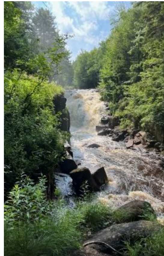
Grasse River Waterfalls