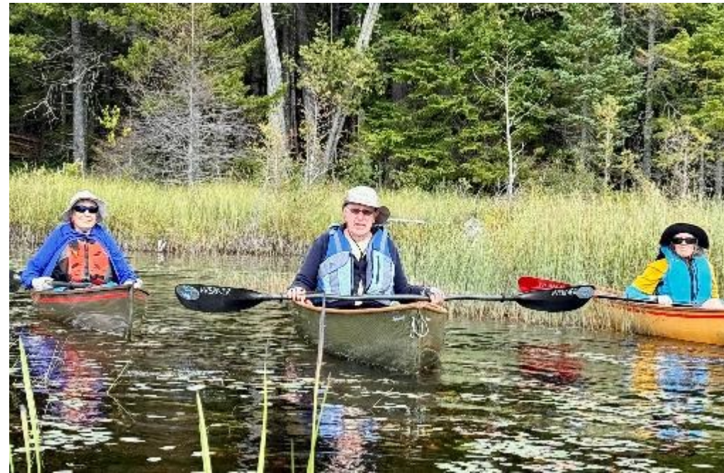
Mud Pond and McRorie Lake