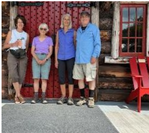
Great Camp Sagamore