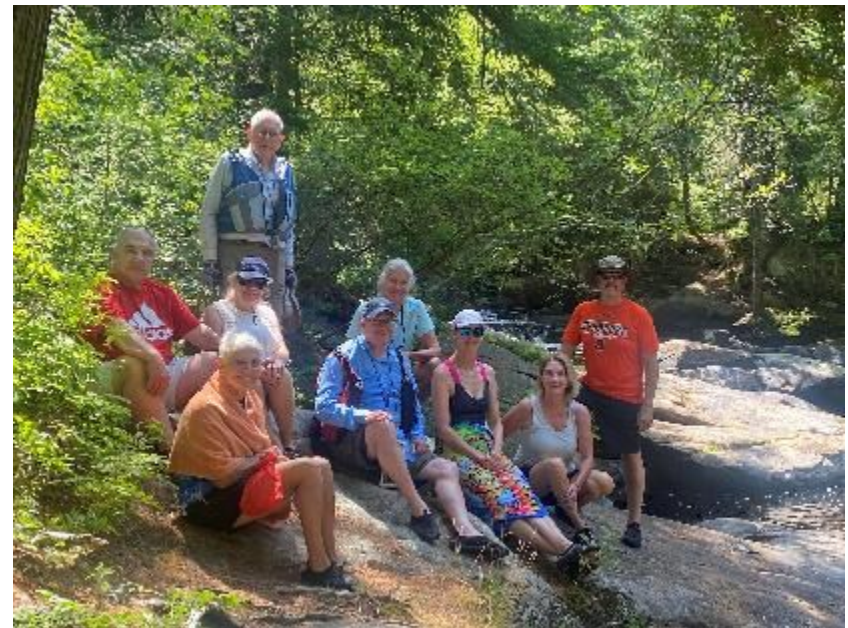
Raquette Lake South Inlet

Today, ten friends—both old and new—set out to paddle the South Bay Inlet of Raquette Lake. Under sunny skies and a warm 84°, we wound our way through the inlet lined with water lilies and pickerelweed. Early in the journey, we were greeted by the sight of a mama loon with her baby. A breeze offered welcome relief from the summer heat and even gave us a boost on the paddle back. Our destination was the waterfalls at the end of the inlet, where we enjoyed a shaded lunch together. Some of us took the opportunity for a swim before hopping back into our boats for the return journey. It was a day filled with friendship, nature, and the joys of summer on the water. ~Shannon Andersen