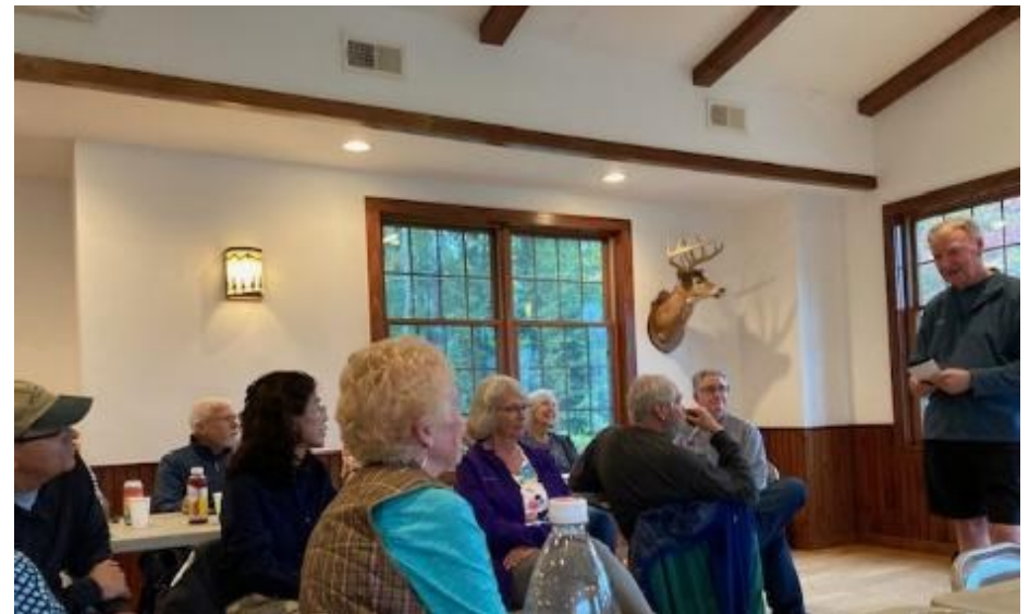
Bolton Landing Community Center