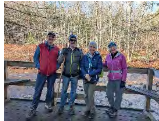
Dean Farm Heritage Trail