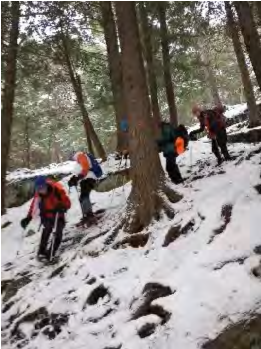
Hopkins Mt. via Cascade Trail

Hiking in the fall with a few inches of snow has it's own rewards. Winter beauty surrounded us. Micro spikes were a maybe/maybe not question. Caution was required in a few areas. But we all enjoyed the adventure. ~Marti Townley