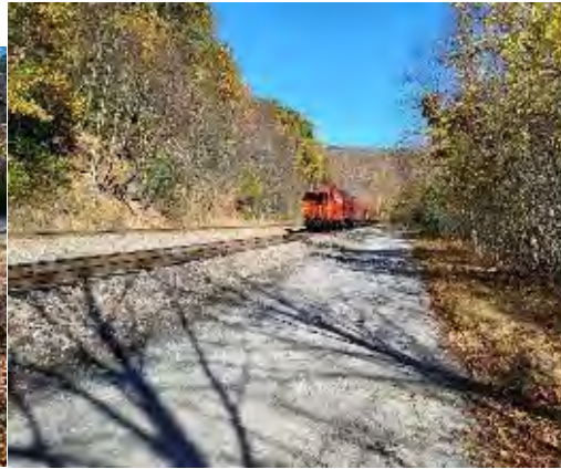
The Gorge Trail

The next ride I want to highlight is the C & O Canal Path. We love the Harpers Ferry portion, but we prefer to stay in Brunswick, because it is on the same side of the canal as the trail, unlike Harpers Ferry. To get to the trail from Harpers Ferry, you must manage to get your bike across a pedestrian bridge that involves a multitude of steps on the canal side.