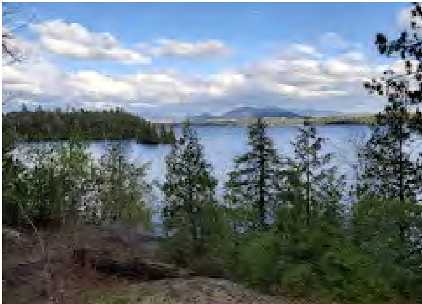
Young Life Camp, Upper Saranac