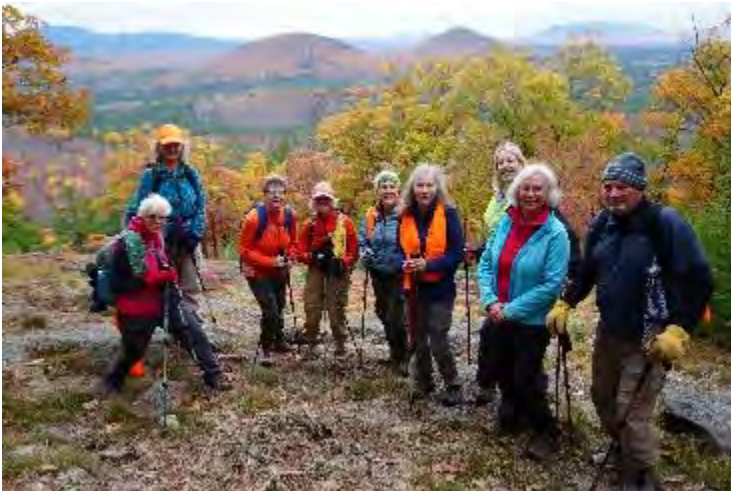
Palmer Pond/McGann Mt